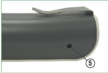
UNITA' DI CONTROLLO - Vista laterale CONTROL UNIT - Side view UNITÉ DE COMMANDE - Vue de côté STEUEREINHEIT - Ansicht seitlich UNIDAD DE CONTROL - Vista lateral