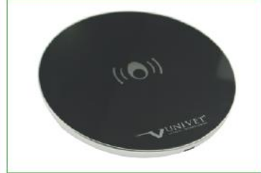
PAD DI RICARICA WIRELESS WIRELESS CHARGING PAD BASE DE CHARGEMENT SANS FIL WIRELESS LADESTATION CARGADOR INALÁMBRICO