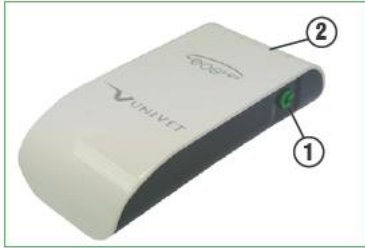
UNITA' DI CONTROLLO - Vista frontale CONTROL UNIT - Front view UNITÉ DE COMMANDE - Vue de face STEUEREINHEIT - Ansicht Vorderseite UNIDAD DE CONTROL - Vista frontal