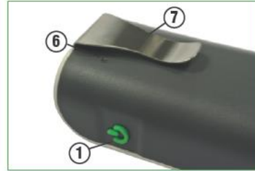
UNITA' DI CONTROLLO - Vista posteriore CONTROL UNIT - Rear view UNITÉ DE COMMANDE - Vue de derrière STEUEREINHEIT - Ansicht Hinterseite UNIDAD DE CONTROL - Vista posterior