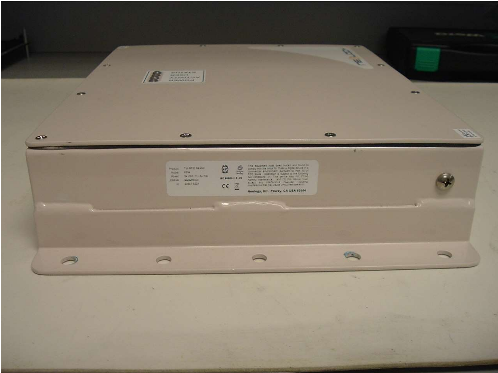
External Photo #1: 6204 Regulatory Label, Left Side