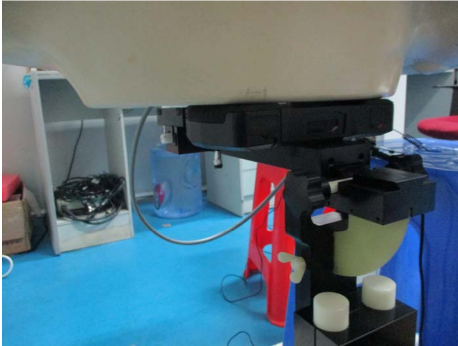
Test Position_Back Antenna Fold (0mm)