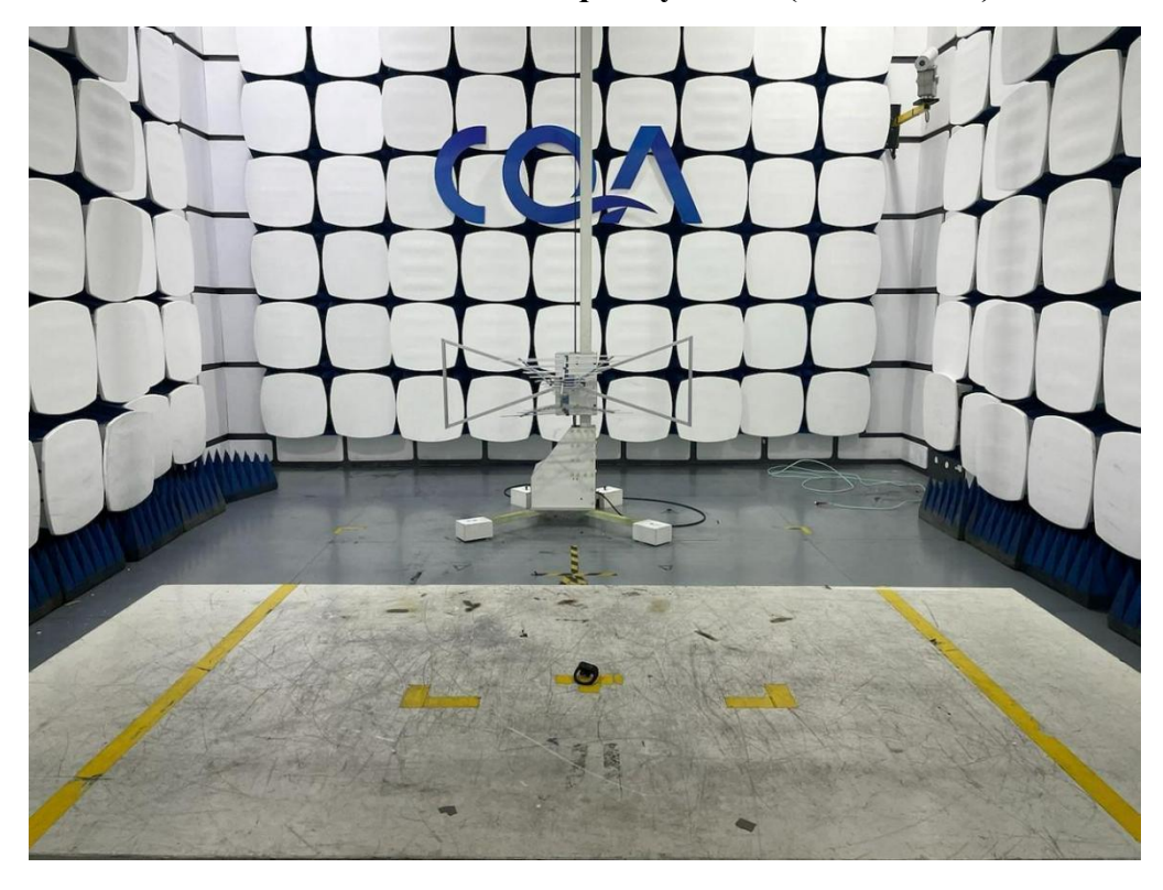
Emissions in restricted frequency bands (above 1GHz)