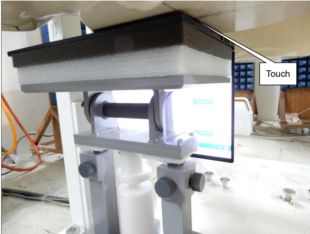
EUT Bottom - Aux