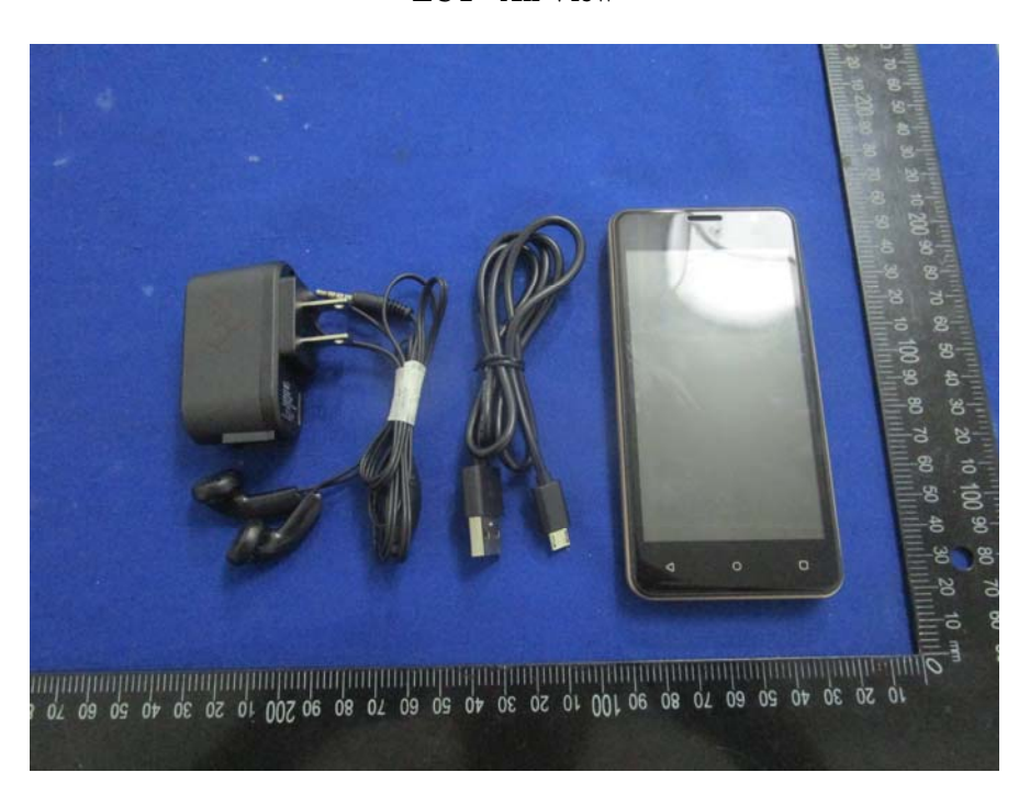
EUT -Adapter View