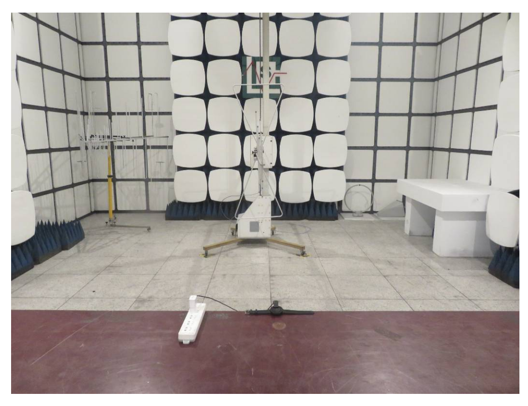
Radiated Emission below 1GHz