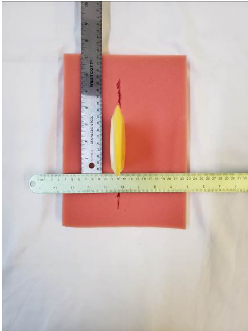
Figure 5. Top of HOST device RT-270, RB-270

FCC Part 15/IC RSS Certification 2AKFQ10032 22165-10032 22-0291 October 27, 2022 Cognosos, Inc. PCB-10032