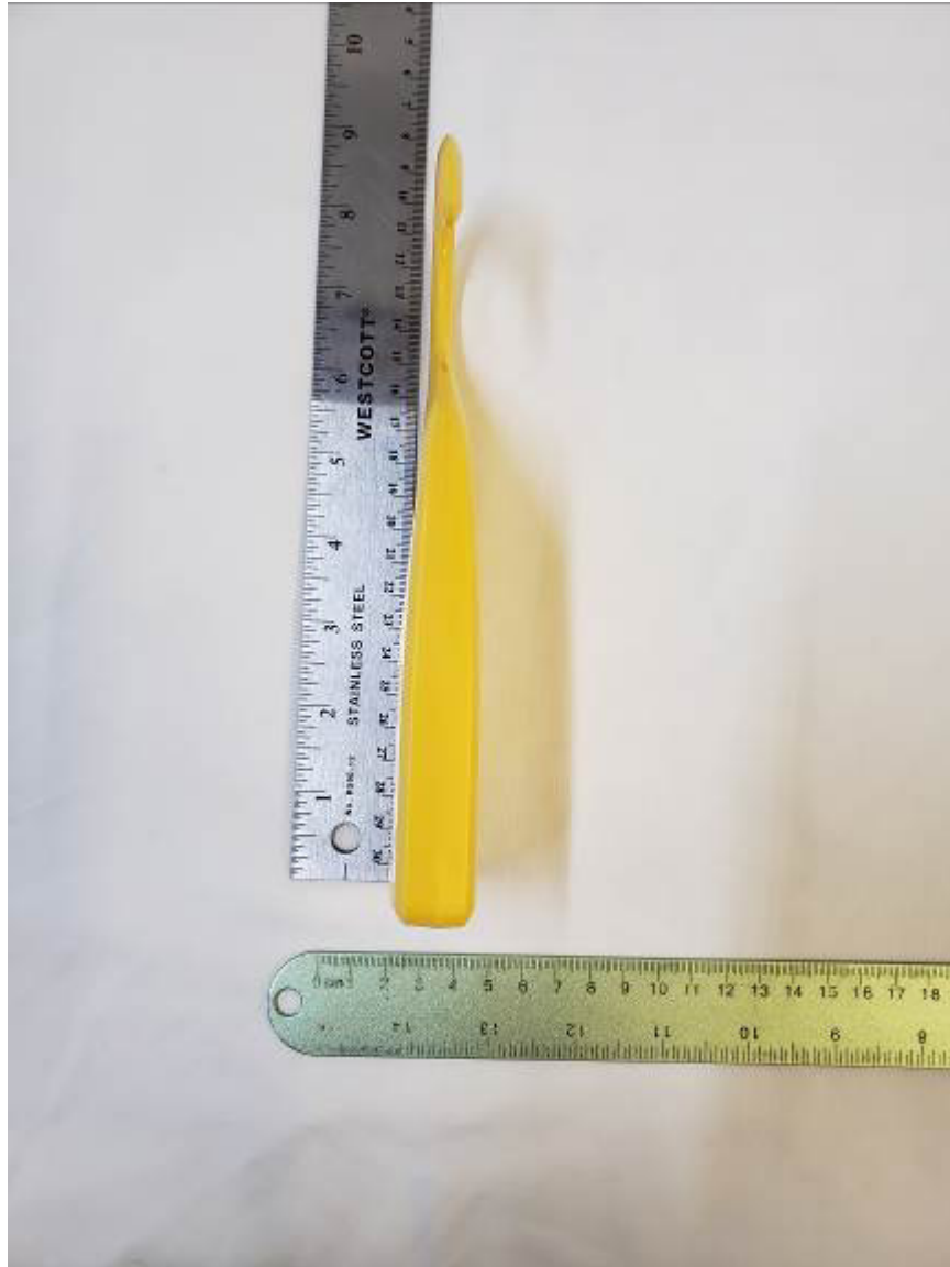
Figure 3. Side 1 of HOST device RT-270, RB-270

FCC Part 15/IC RSS Certification 2AKFQ10032 22165-10032 22-0291 October 27, 2022 Cognosos, Inc. PCB-10032