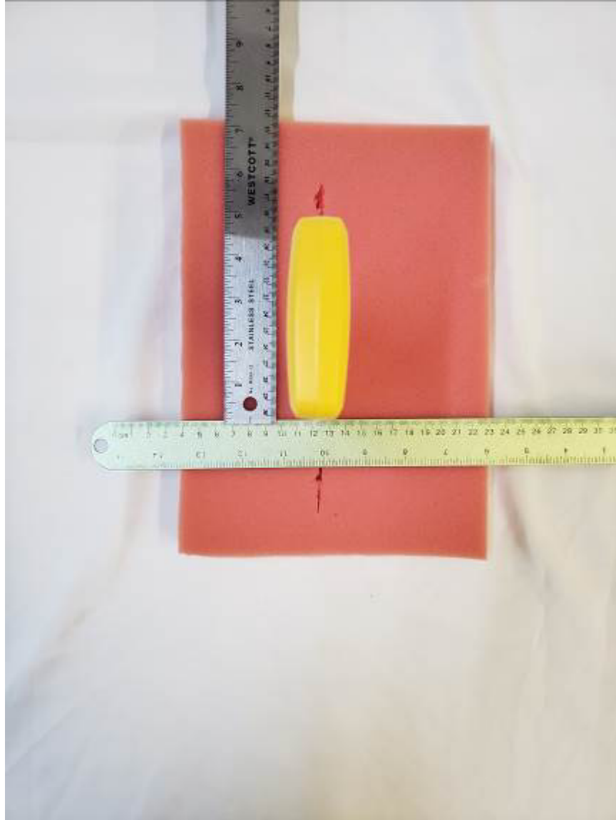
Figure 6. Bottom of HOST device RT-270, RB-270

FCC Part 15/IC RSS Certification 2AKFQ10032 22165-10032 22-0291 October 27, 2022 Cognosos, Inc. PCB-10032