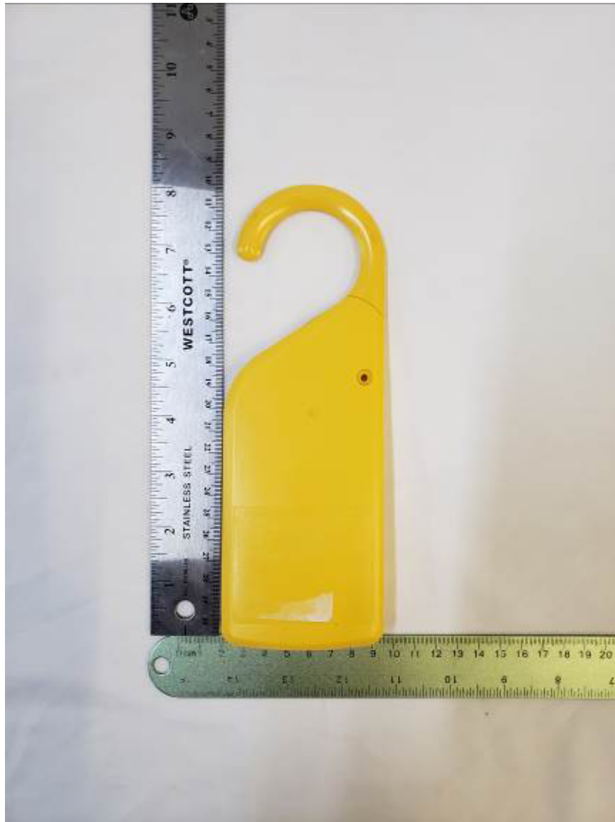
Figure 2. Back of HOST device RT-270, RB-270

FCC Part 15/IC RSS Certification 2AKFQ10032 22165-10032 22-0291 October 27, 2022 Cognosos, Inc. PCB-10032