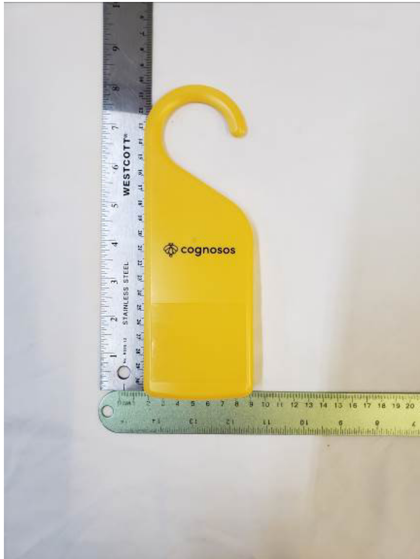
Figure 1. Front of HOST device RT-270, RB-270