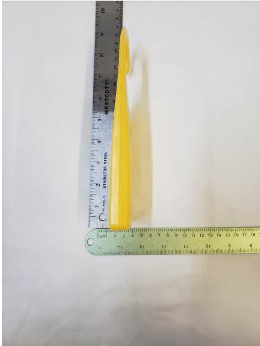
Figure 4. Side 2 of HOST device RT-270, RB-270

FCC Part 15/IC RSS Certification 2AKFQ10032 22165-10032 22-0291 October 27, 2022 Cognosos, Inc. PCB-10032