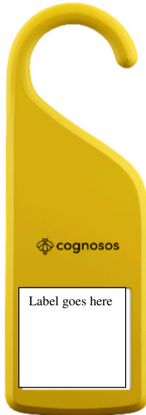
Figure 3. Host Label Location

FCC Part 15 Certification/ RSS 210 2AKFQ10032 22165-10032 22-0291 October 27, 2022 Cognosos, Inc. PCB-10032