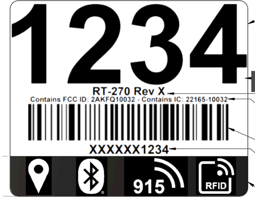
Figure 2. Sample Label for Host device

FCC Part 15 Certification/ RSS 210 2AKFQ10032 22165-10032 22-0291 October 27, 2022 Cognosos, Inc. PCB-10032