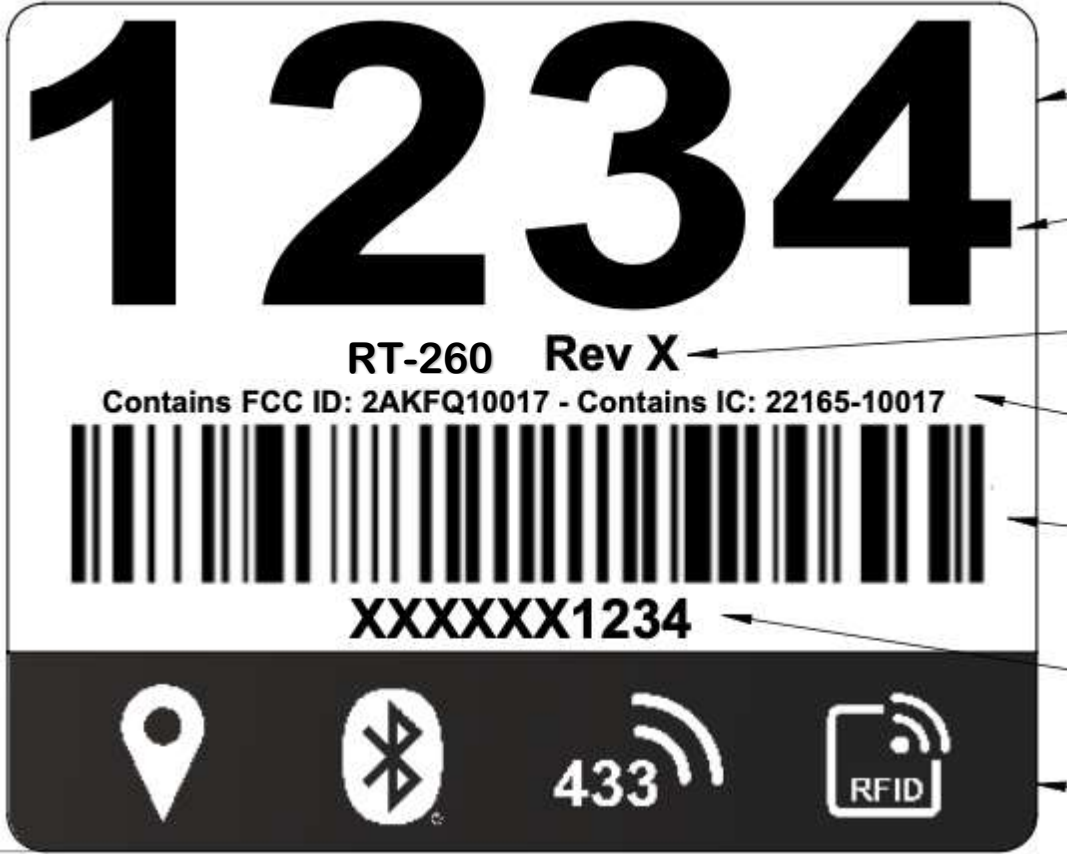
Sample Host Label 2