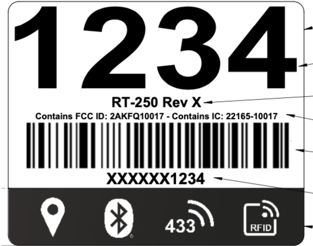
Sample Host Label 1