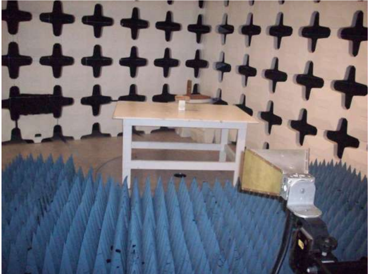
Figure 5. Radiated Emissions Test Setup (Above 1 GHz, Unintentional Emissions)

FCC Part 15 Certification/ RSS 210 2AKFQ10016 22165-10016 19-0422 December 2, 2019 Cognosco RT-300