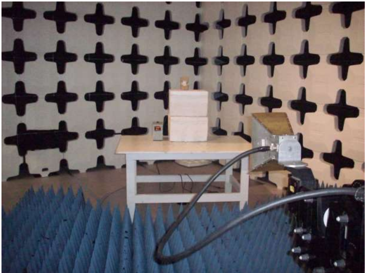
Figure 6. Intentional Radiated Emissions Test Setup (Above 1GHz, Intentional Emissions)

FCC Part 15 Certification/ RSS 210 2AKFQ10016 22165-10016 19-0422 December 2, 2019 Cognosco RT-300