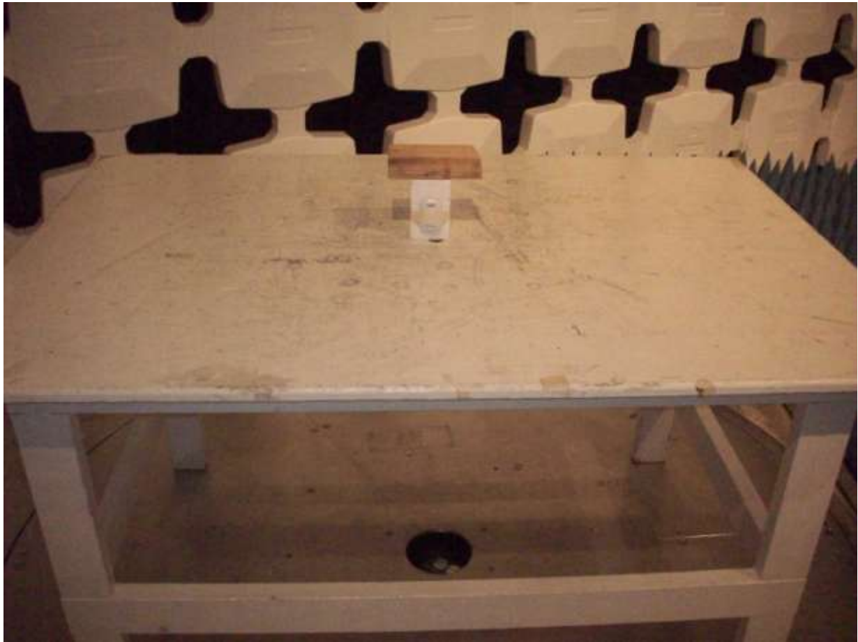
Figure 1. Radiated Emissions Test Setup (Unintentional)