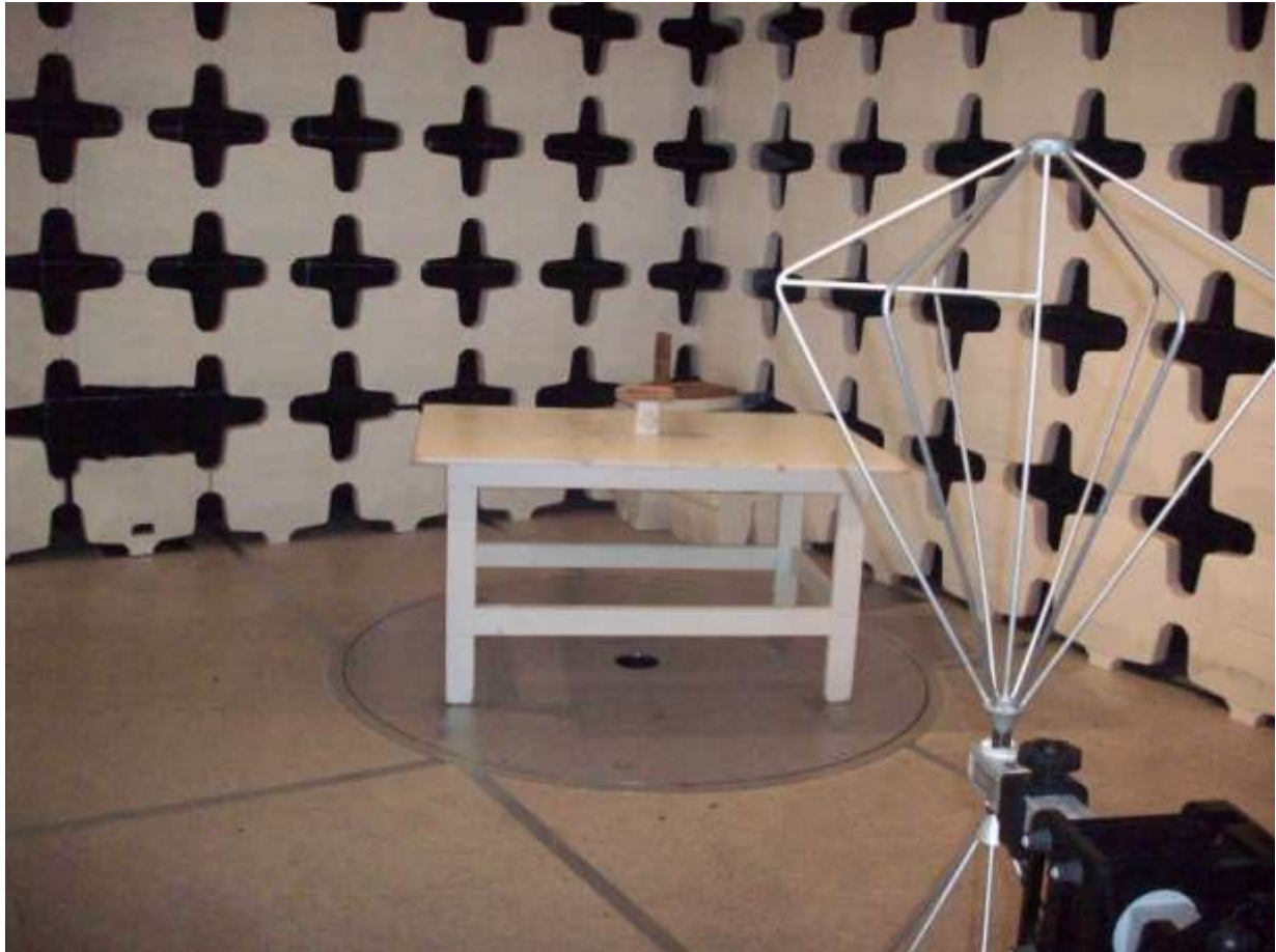
Figure 3. Radiated Emissions Test Setup (30 - 200 MHz)

FCC Part 15 Certification/ RSS 210 2AKFQ10016 22165-10016 19-0422 December 2, 2019 Cognosco RT-300