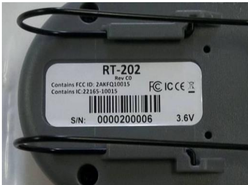
Figure 5. Host Device Label

FCC Part 15 Certification/ RSS 210 2AKFQ10015 22165-10015 18-0167 October 17, 2018 Cognosos Inc PCA-10015