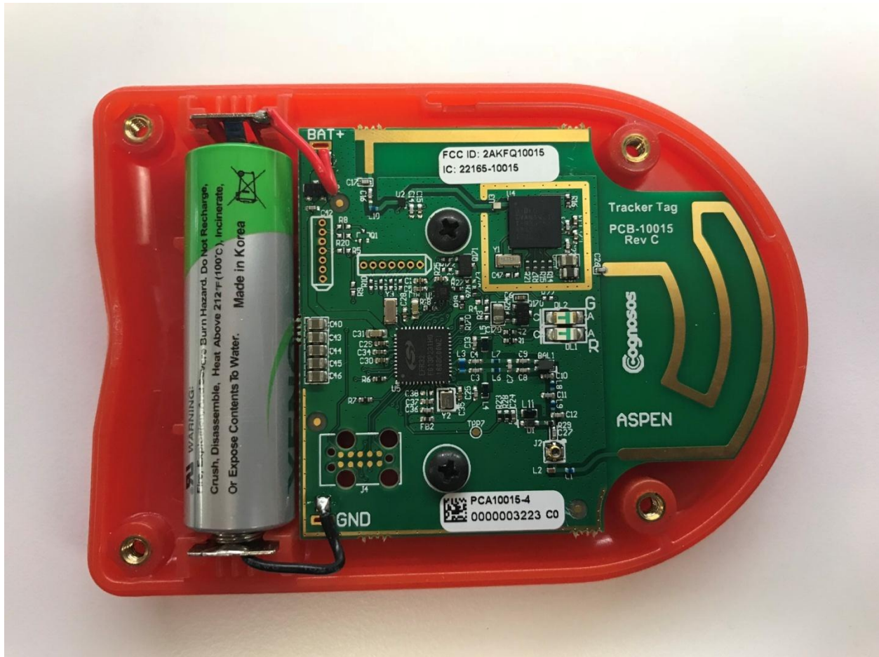
Figure 4. Sample Label for HVIN PCA10015-4

FCC Part 15 Certification/ RSS 210 2AKFQ10015 22165-10015 18-0167 October 17, 2018 Cognosos Inc PCA-10015