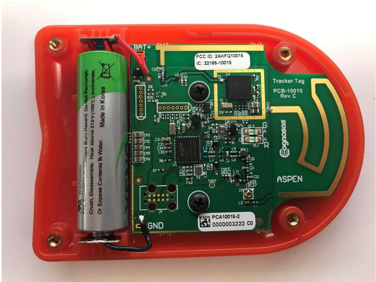
Figure 2. Sample Label for HVIN PCA10015-2

FCC Part 15 Certification/ RSS 210 2AKFQ10015 22165-10015 18-0167 October 17, 2018 Cognosos Inc PCA-10015