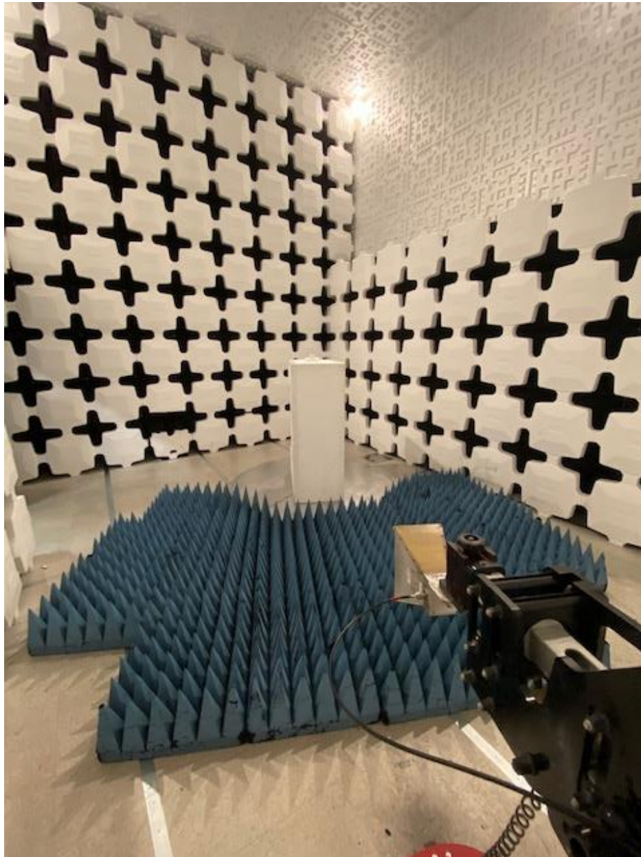
Figure 5. Radiated Emissions Test Setup (1 GHz – 25 GHz))

FCC Part 15 Certification/ RSS 210 2AKFQ-RB300 22165-RB300 21-0035 April 2, 2021 Cognosos, Inc. RB-300