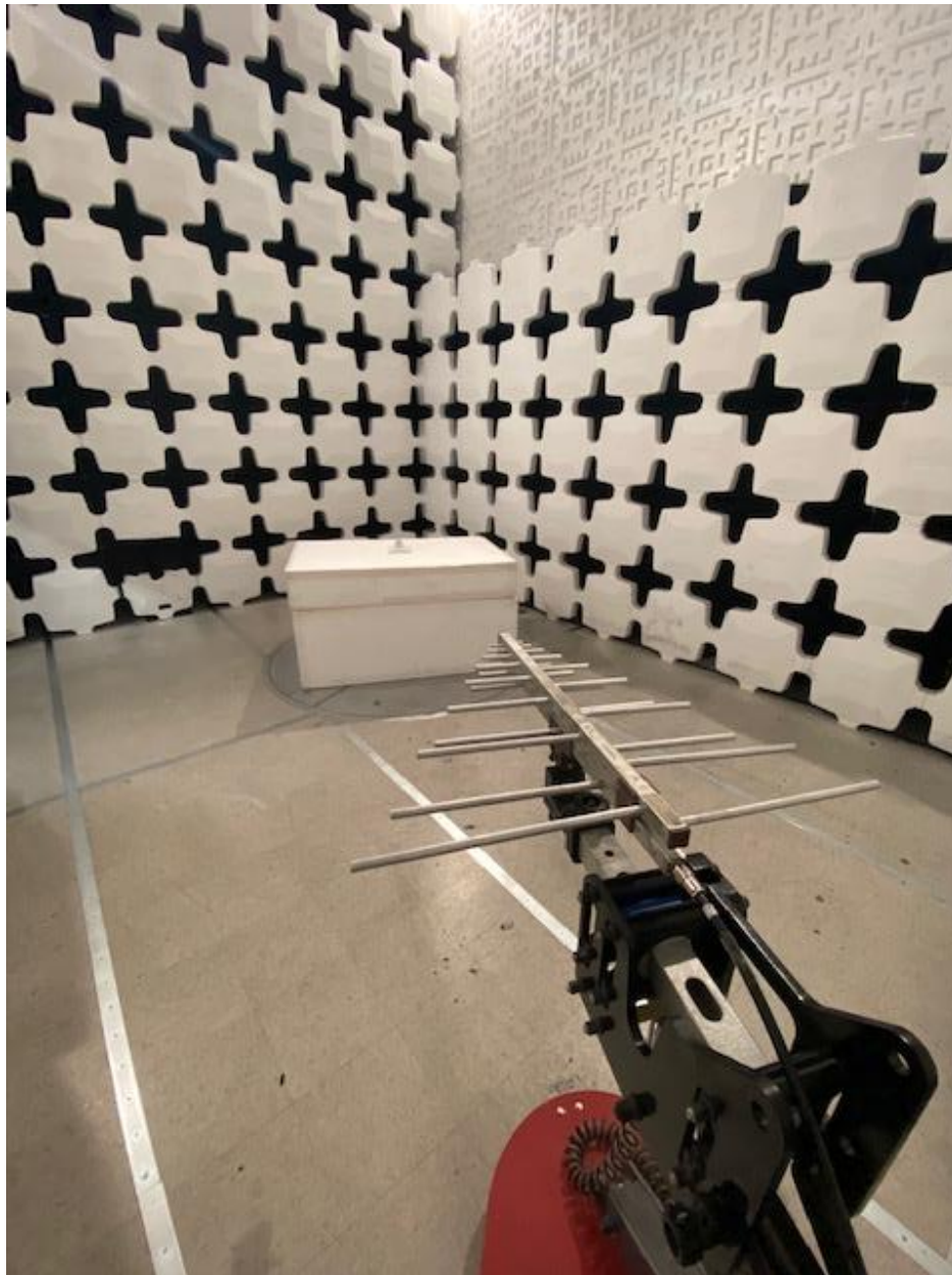
Figure 4. Radiated Emissions Test Setup (200 MHz - 1 GHz)

FCC Part 15 Certification/ RSS 210 2AKFQ-RB300 22165-RB300 21-0035 April 2, 2021 Cognosos, Inc. RB-300