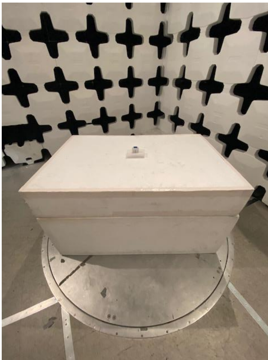
Figure 1. Radiated Emissions Test Setup