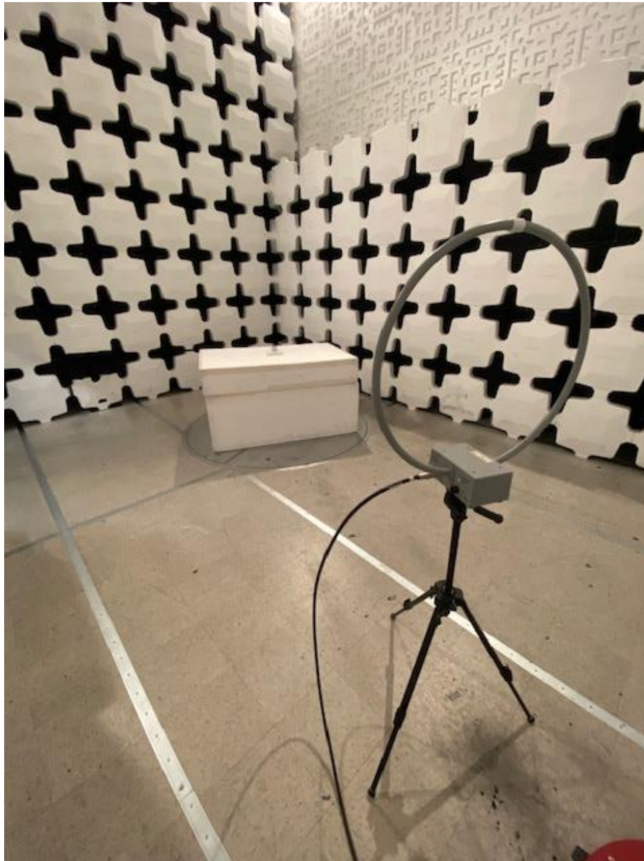
Figure 2. Radiated Emissions Test Setup (9 kHz - 30 MHz)

FCC Part 15 Certification/ RSS 210 2AKFQ-RB300 22165-RB300 21-0035 April 2, 2021 Cognosos, Inc. RB-300