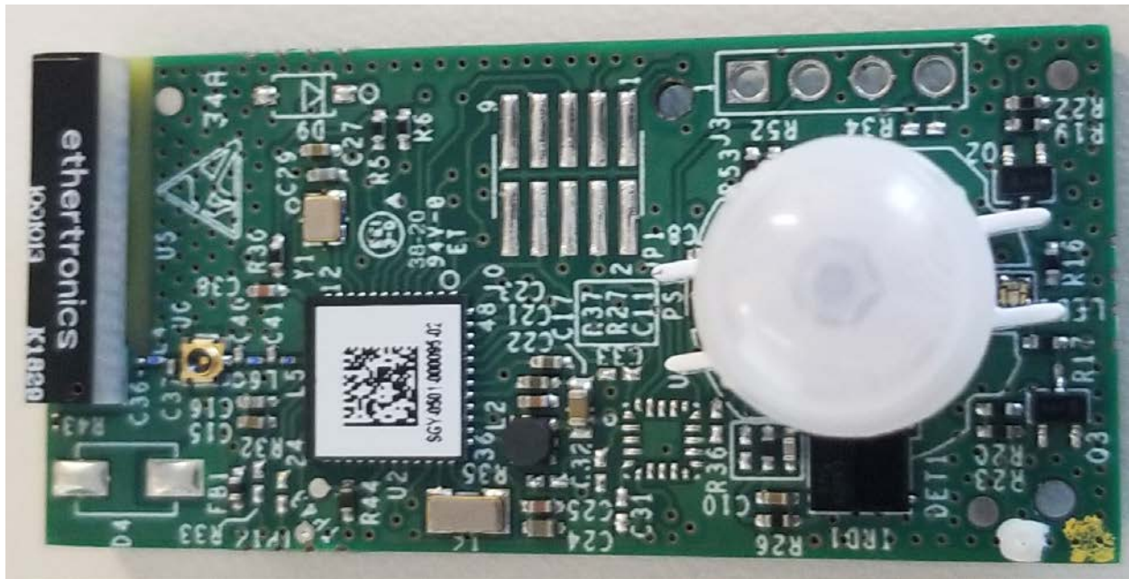
Figure 1: Front View