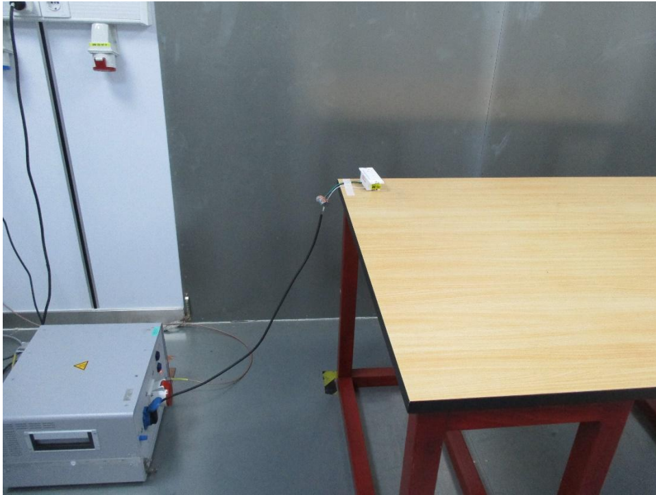
Radiated Emission test of 30MHz-1GHz