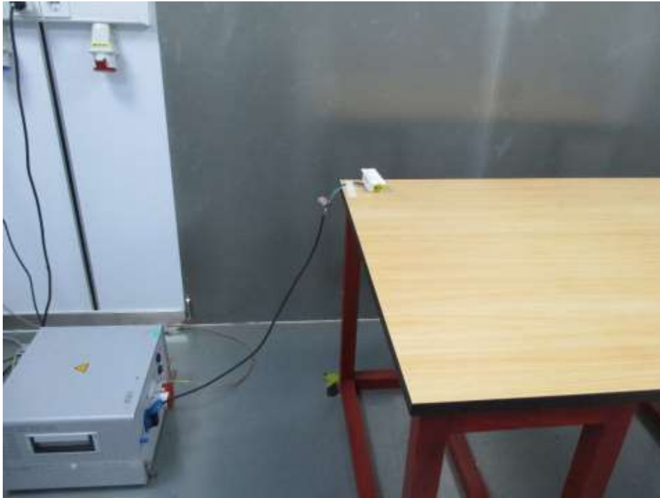
Radiated Emission test of 30MHz-1GHz