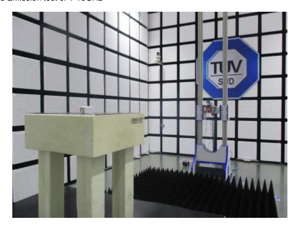
Radiated Emission test 18-25GHz