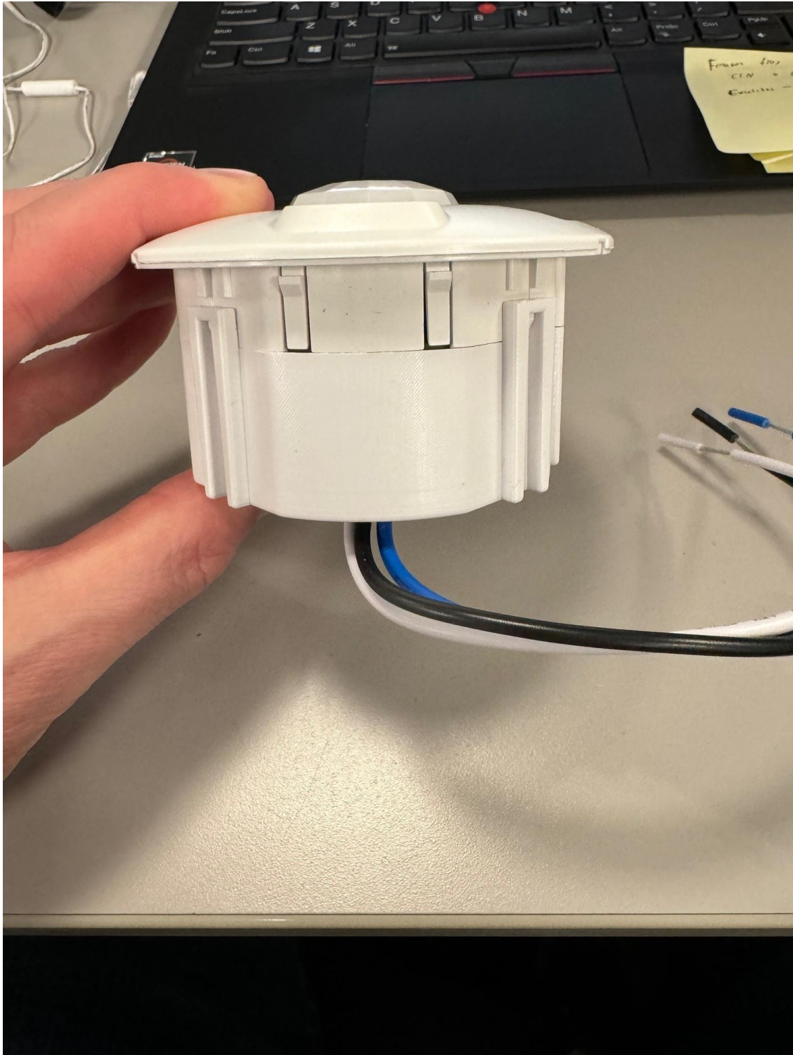
Figure 2: Line Voltage Side View 1