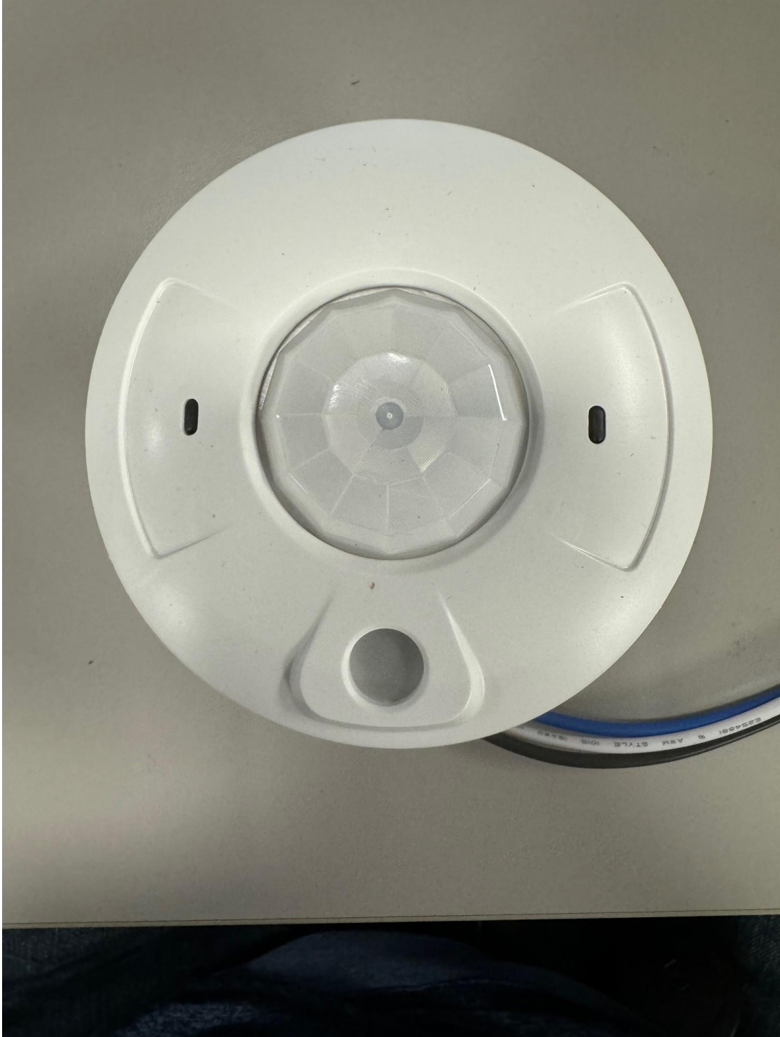
Figure 1: Line Voltage Top View