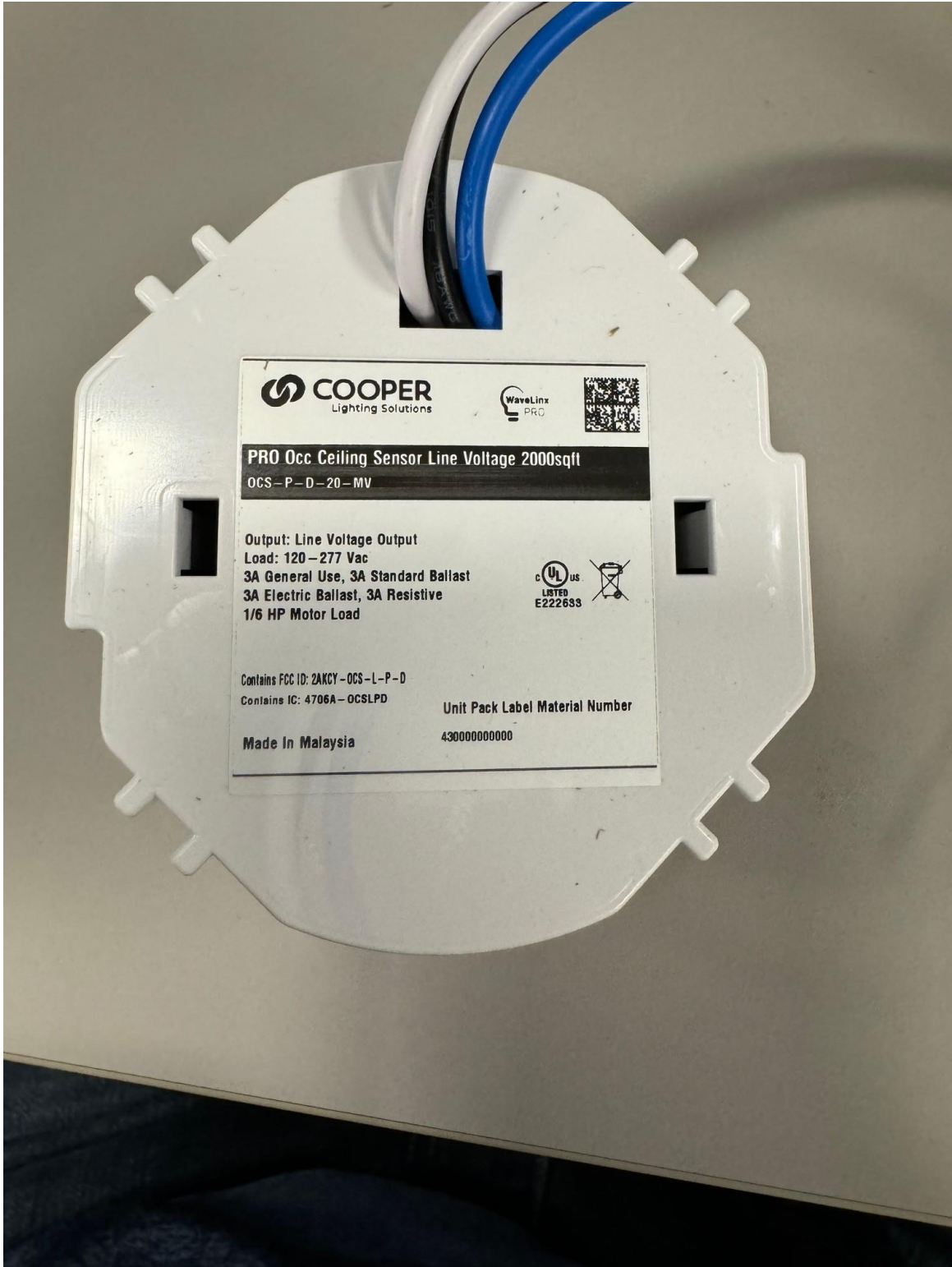
Figure 4: Line Voltage Bottom View