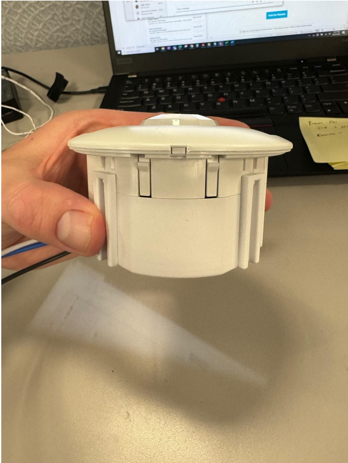
Figure 3: Line Voltage Side View 2