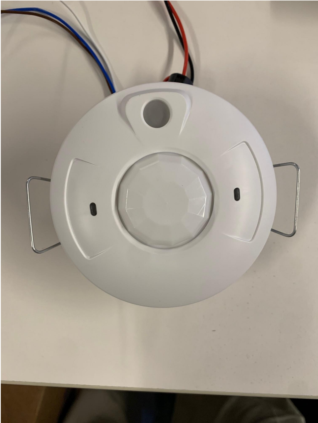
Figure 5: Low Voltage Top View