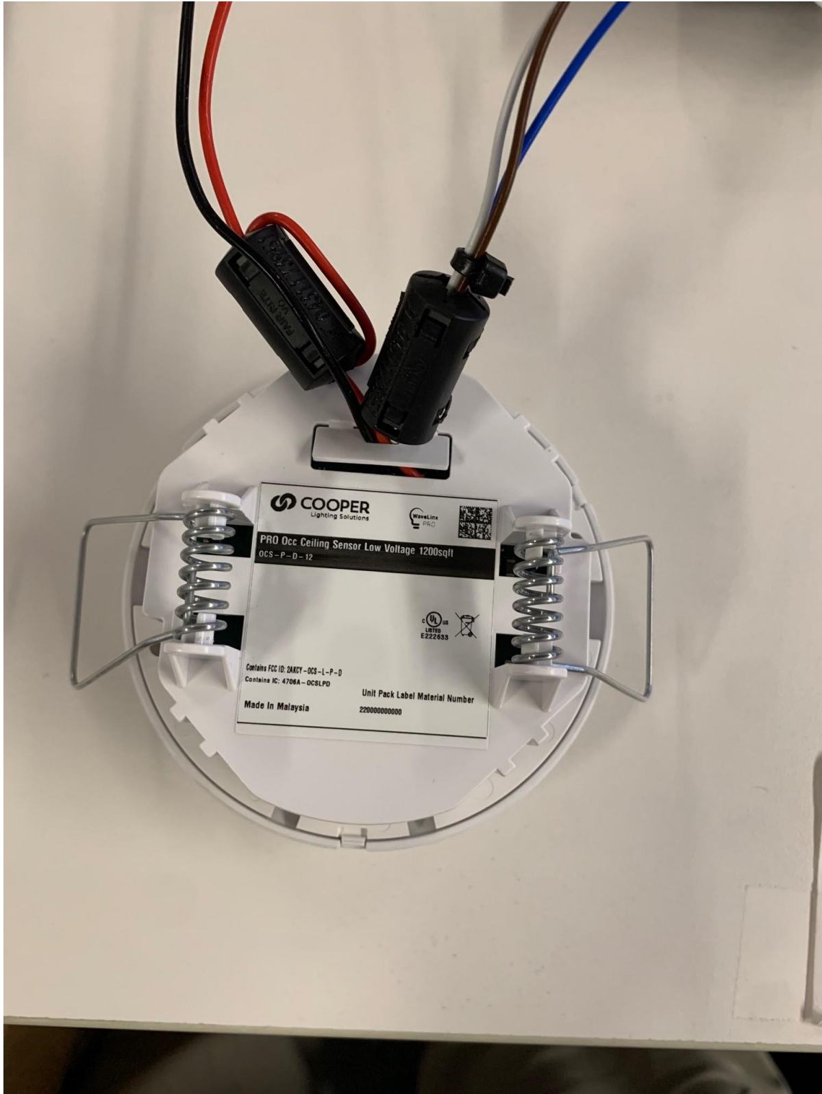
Figure 8: Low Voltage Bottom View