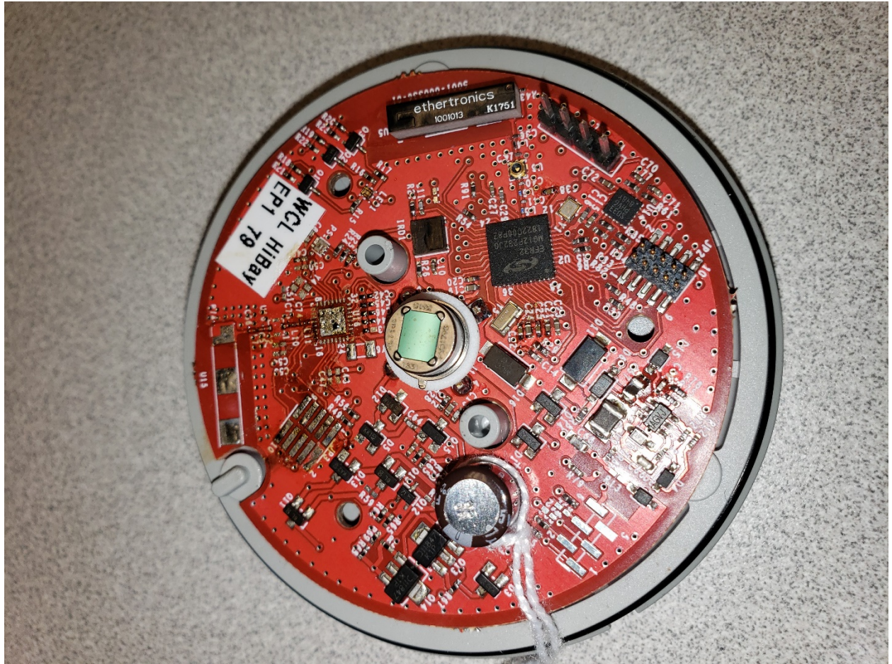
Figure 1: Top View