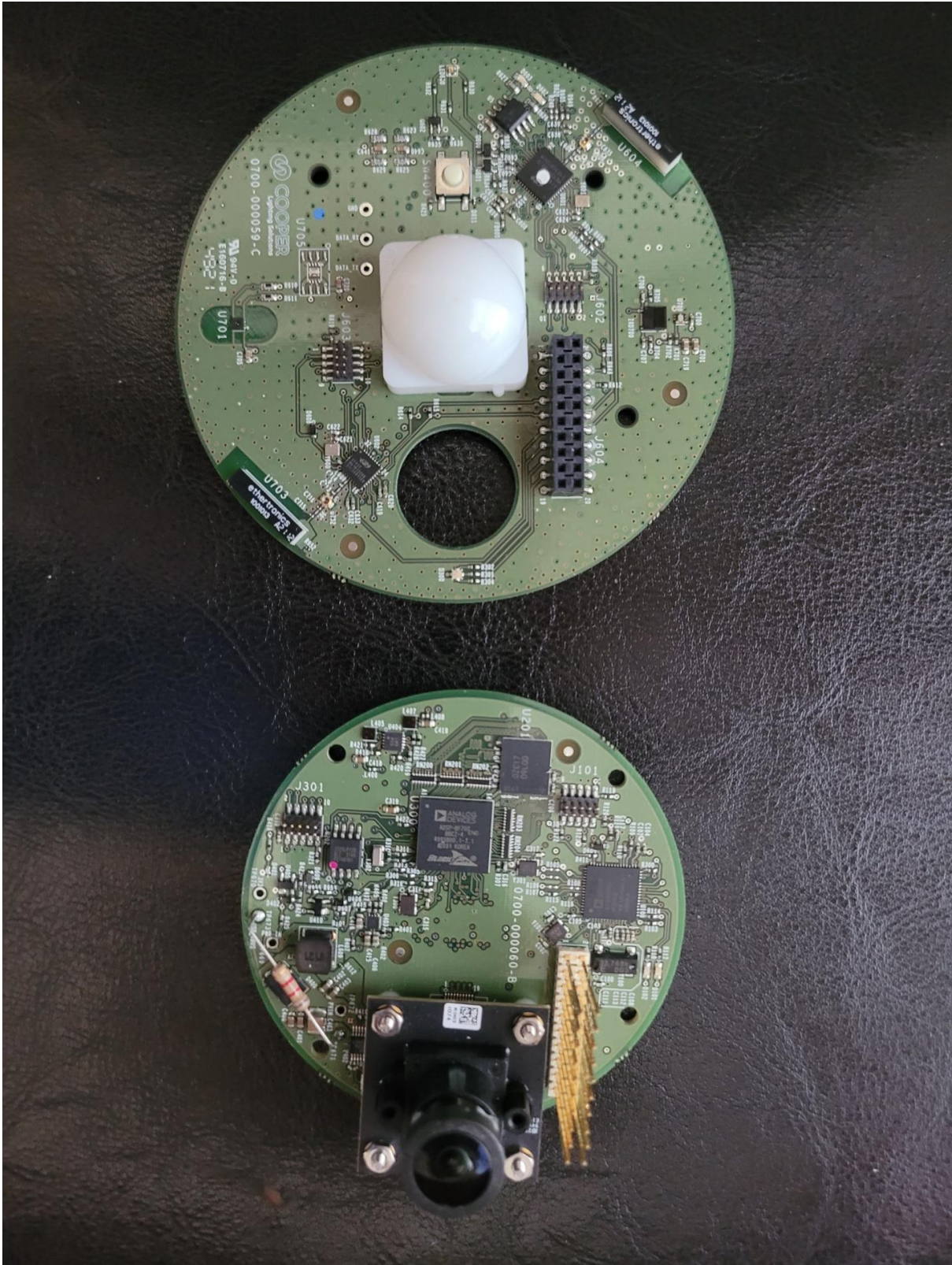
Figure 1: Top View