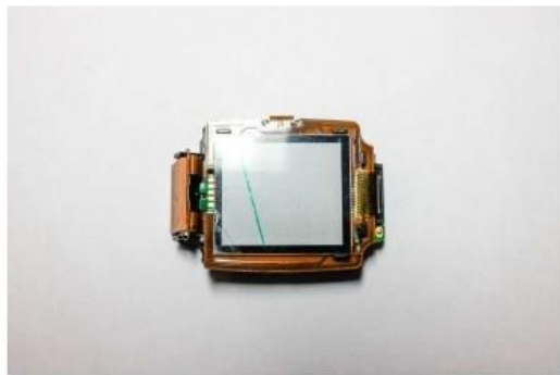
PCB Assembly Complete Top