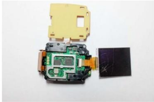
PCB Top Side