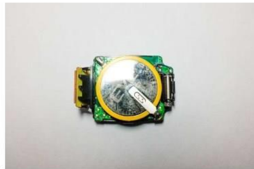
PCB Assembly Complete Bottom