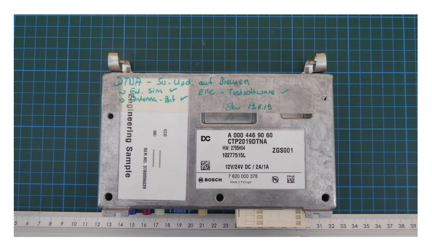
EUT, top view