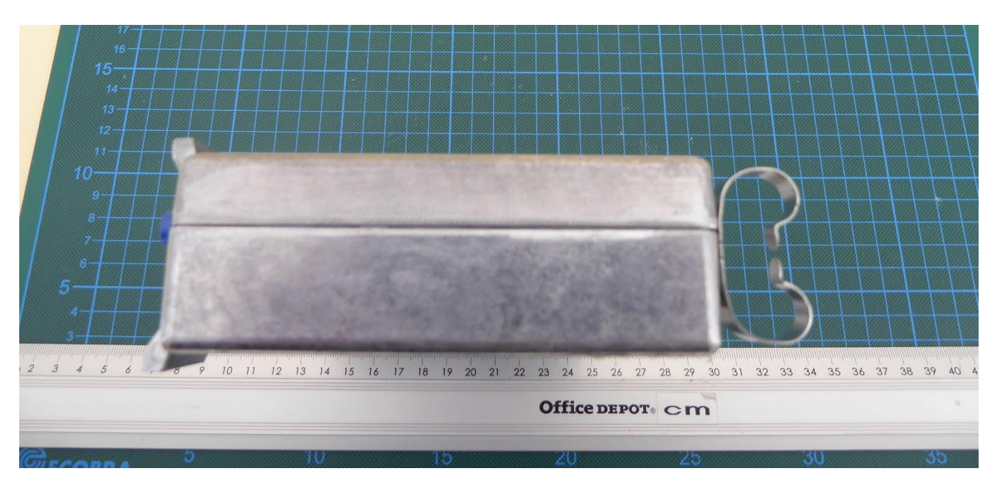
EUT, side view (left)