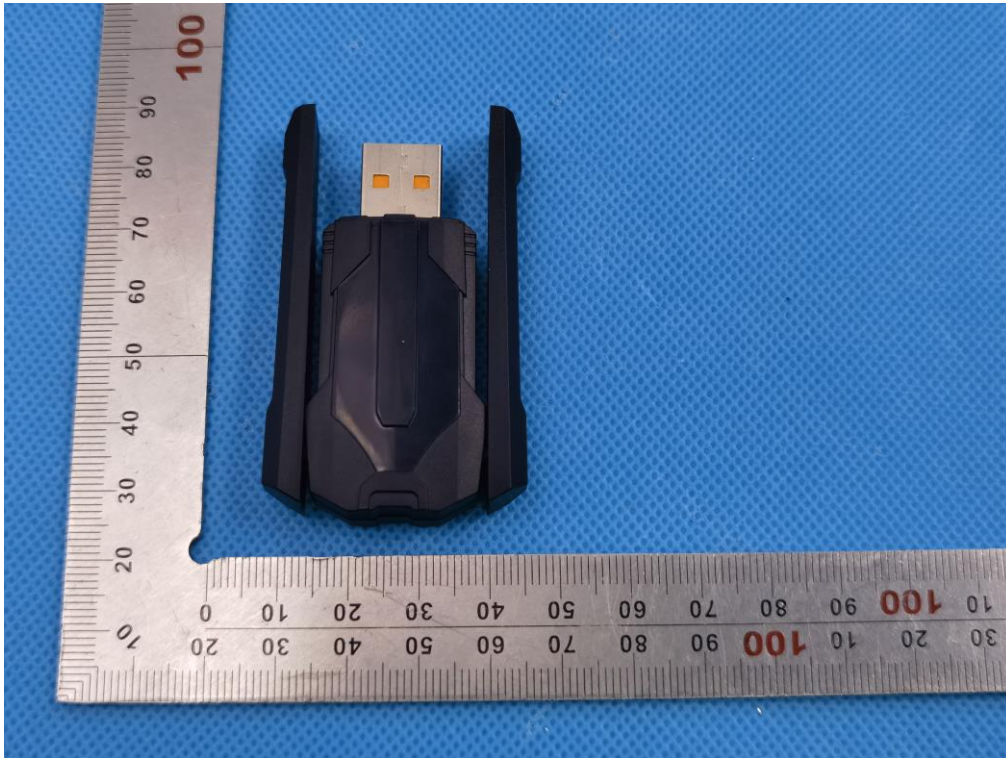
BACK VIEW OF EUT