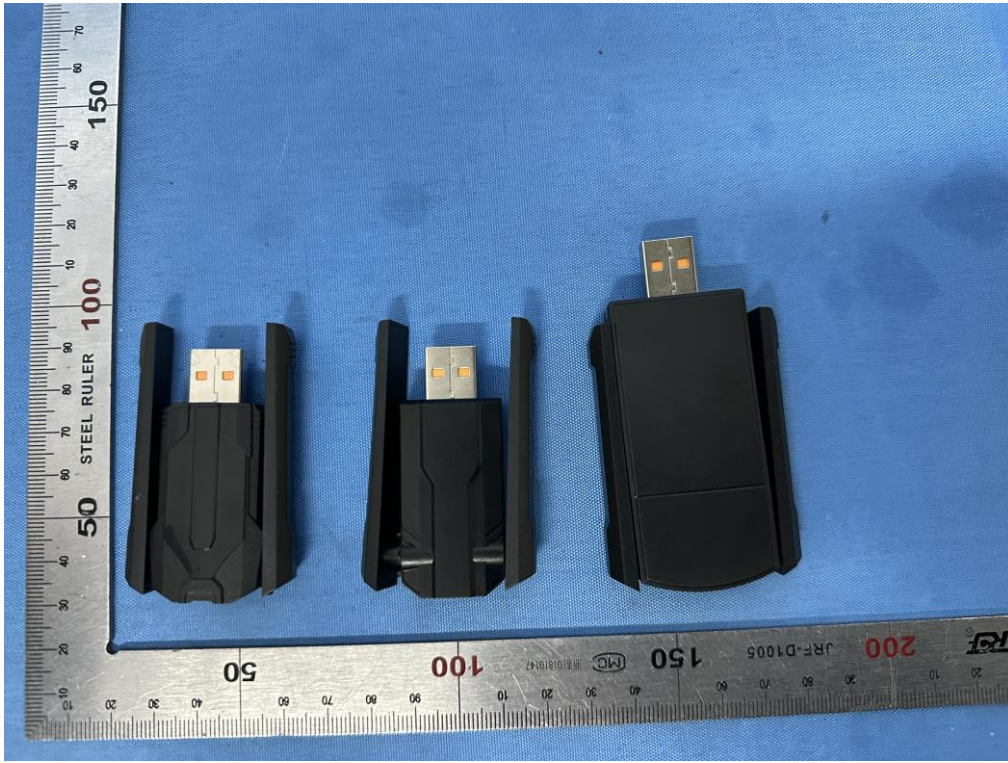
ALL VIEW OF EUT-2