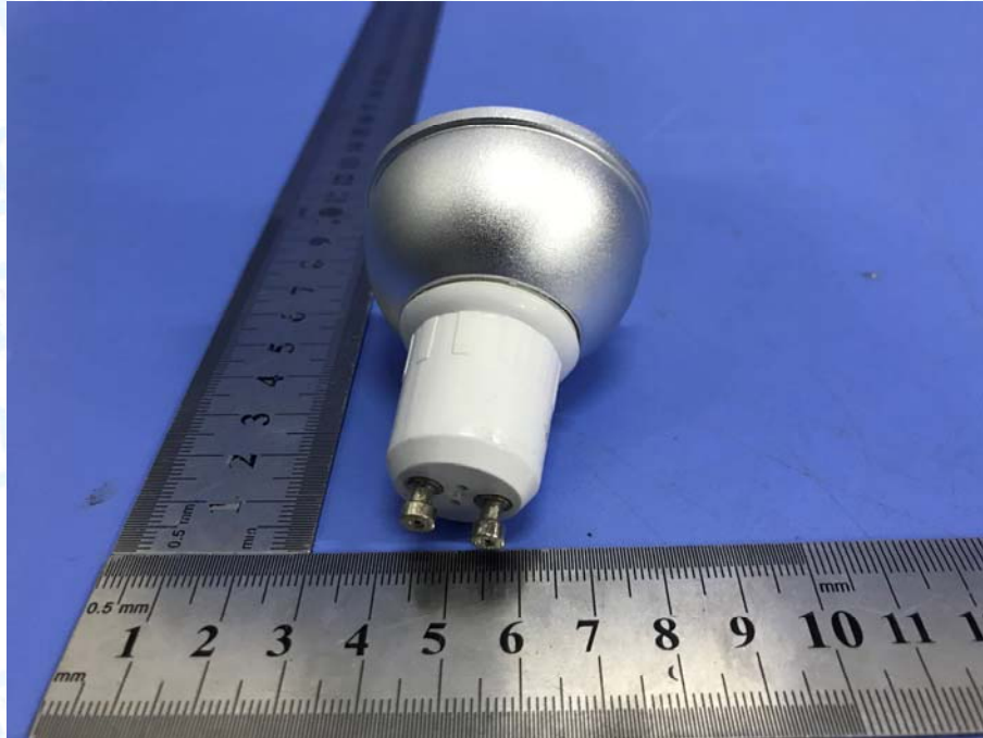
Photo 2 Appearance of EUT