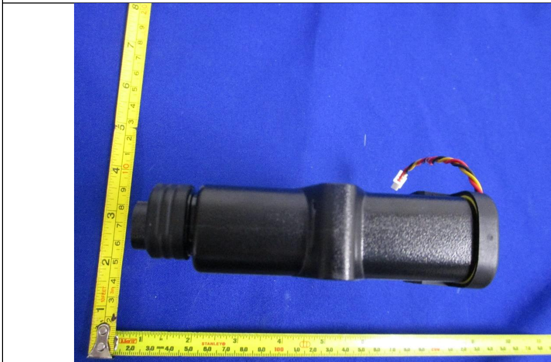
EUT Right View