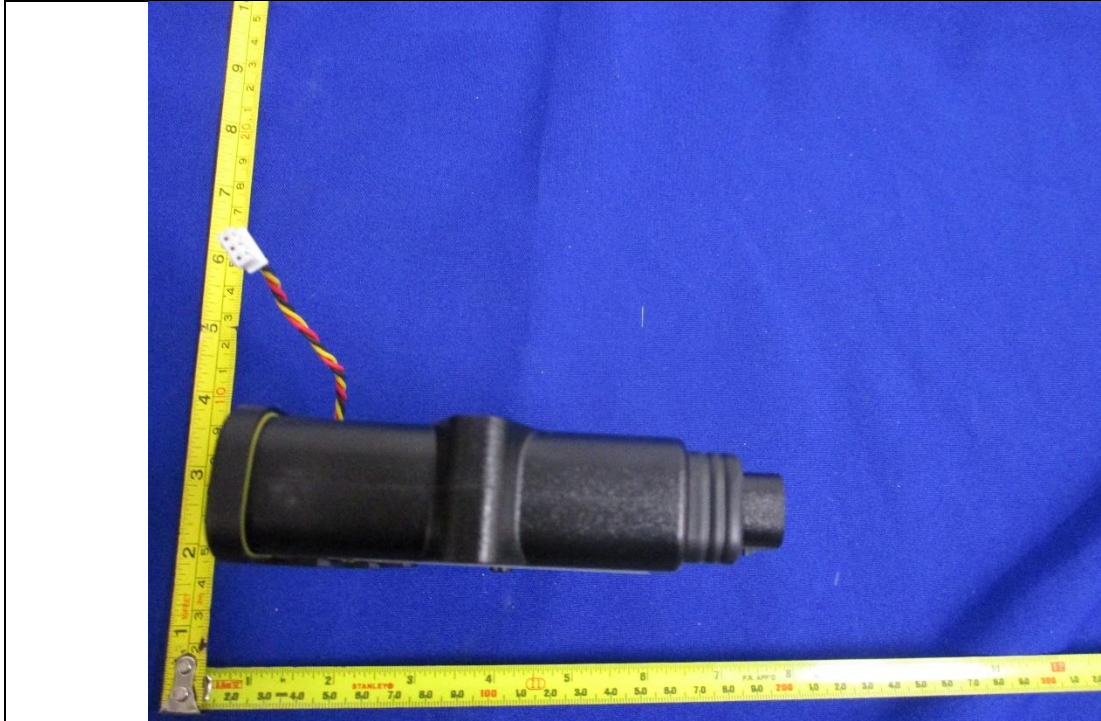
EUT Left View