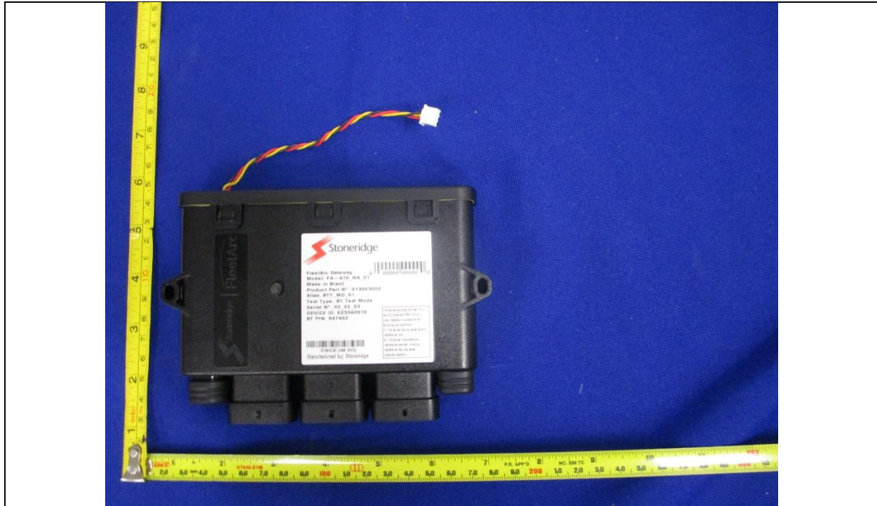
EUT Front View