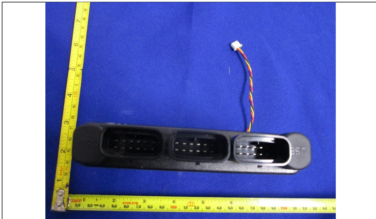
EUT Top View