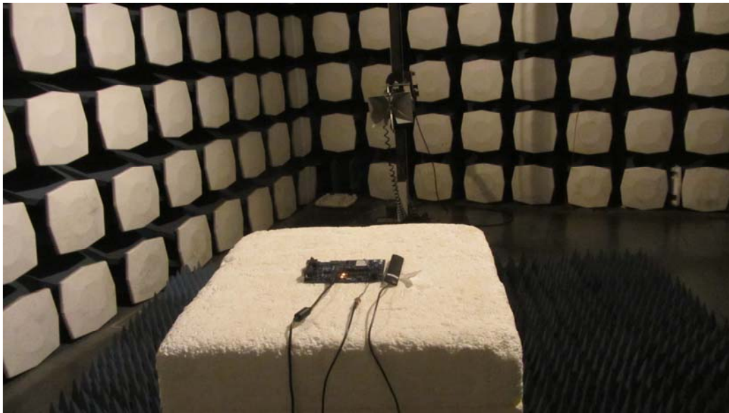
Radiated Spurious Emissions Test setup