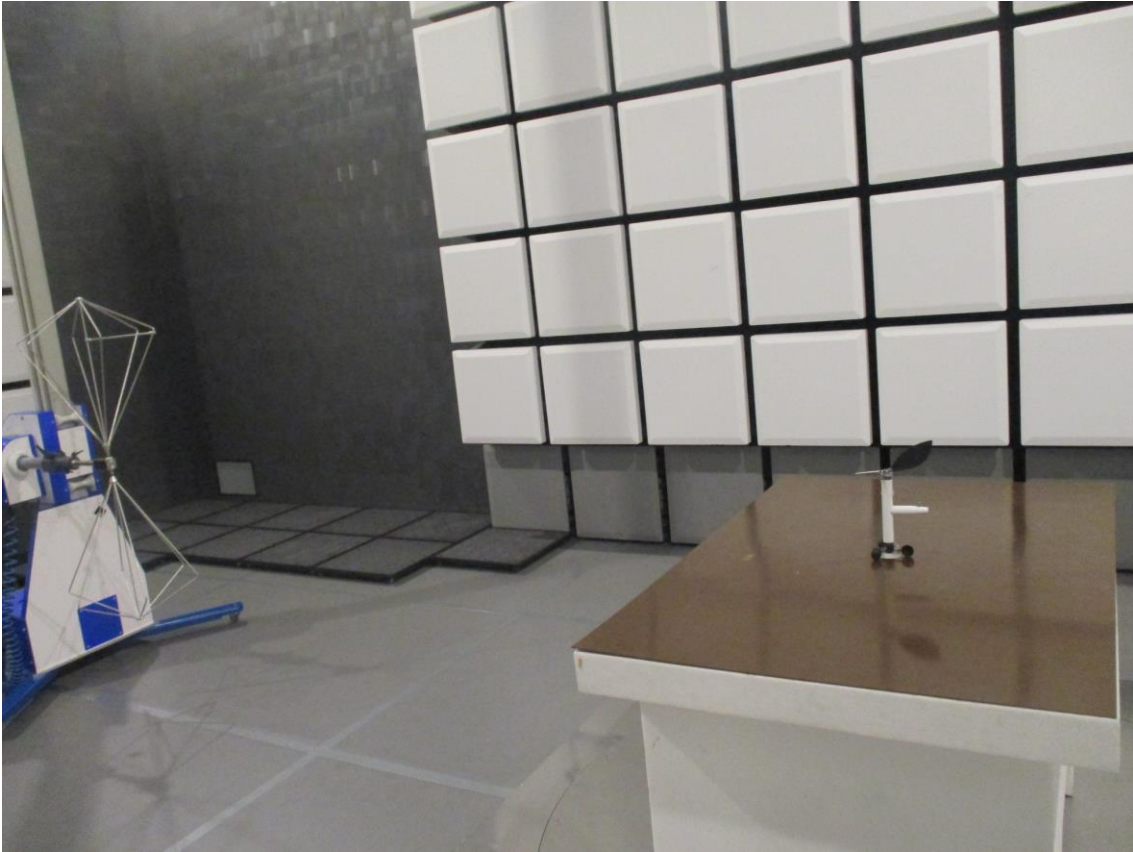
Figure 2: Radiated emission test, 30 MHz – 200 MHz