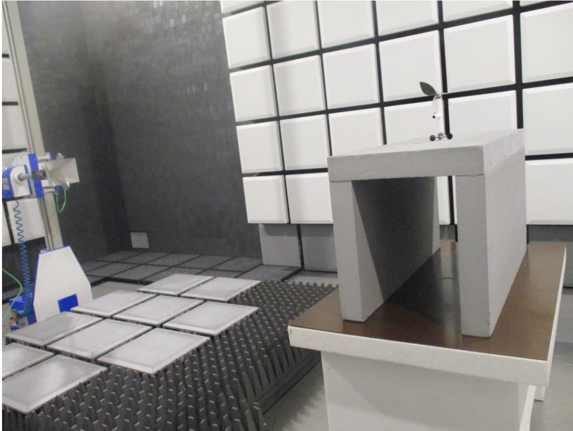
Figure 4: Radiated emission test, 1 GHz – 10 GHz