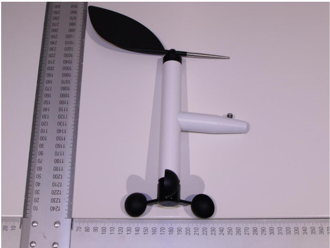
Figure 2: WSD 011-2