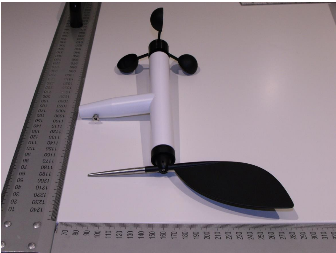
Figure 4: WSD 011-2