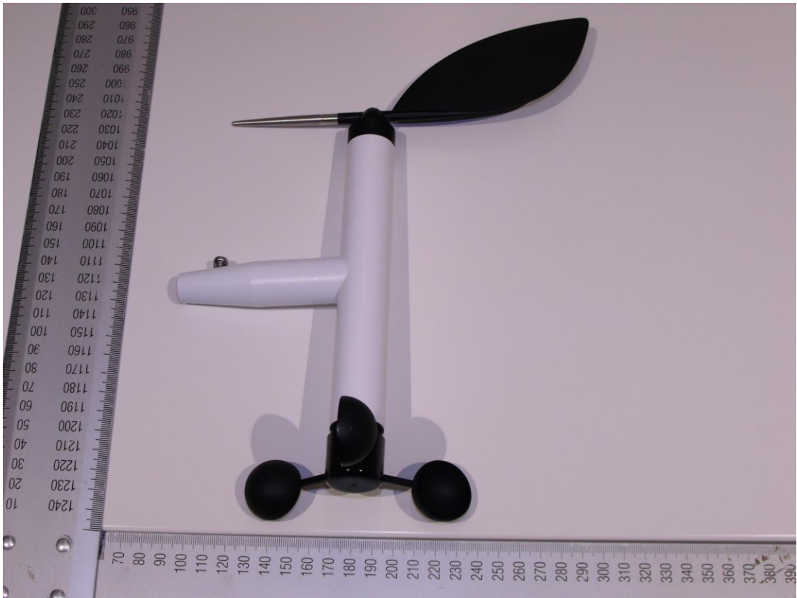
Figure 1: WSD 011-2