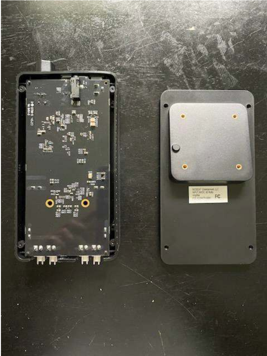
Bottom of PCB shown in chassis