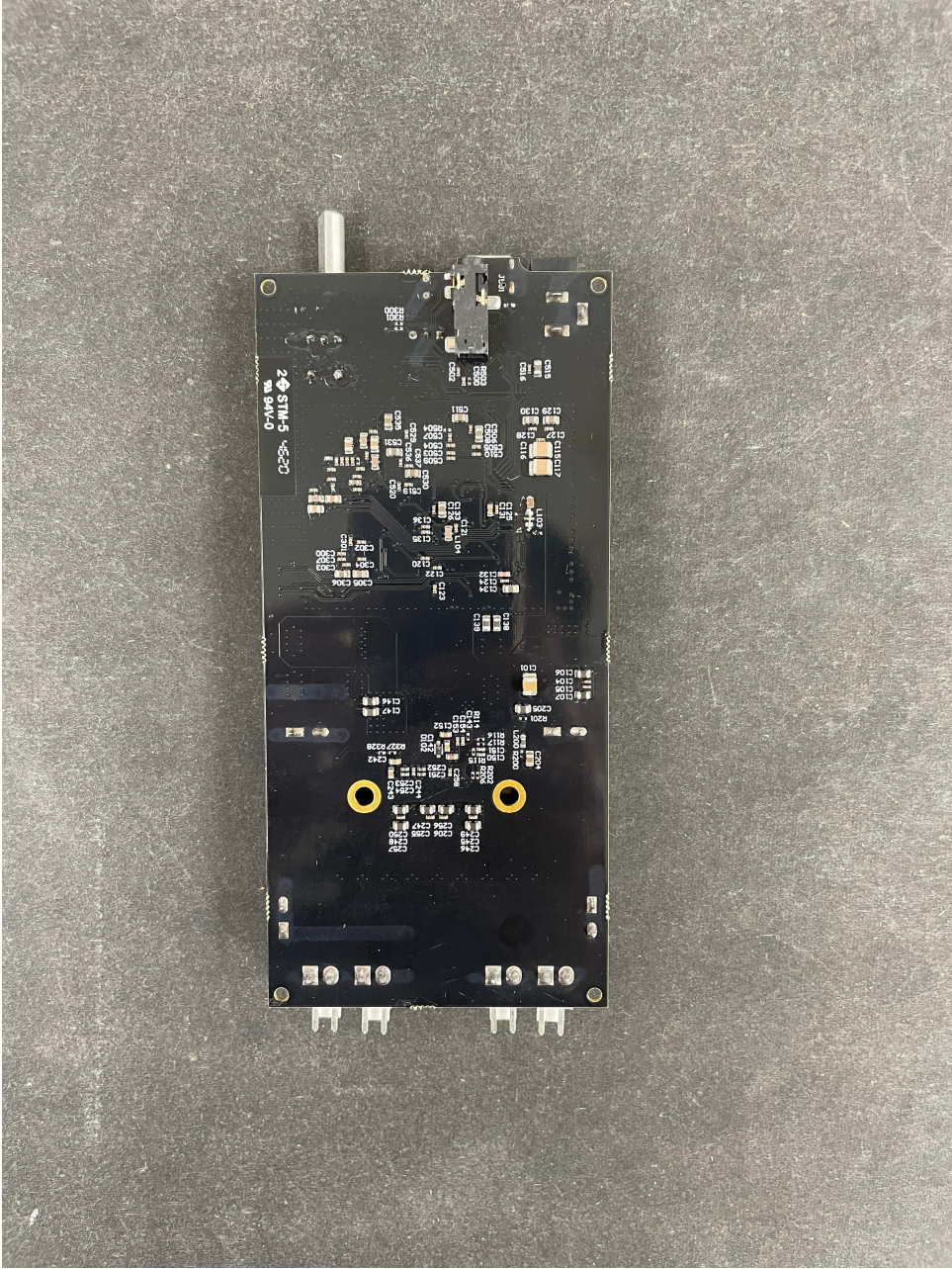
Bottom of PCB