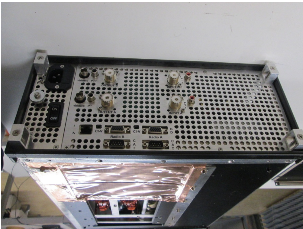
Photo A3-4: protective earth connection of LAN port bonded to casing