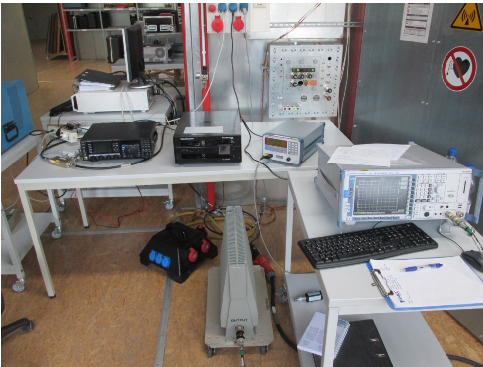
Photo A1-4 spurious emissions and gain measurement