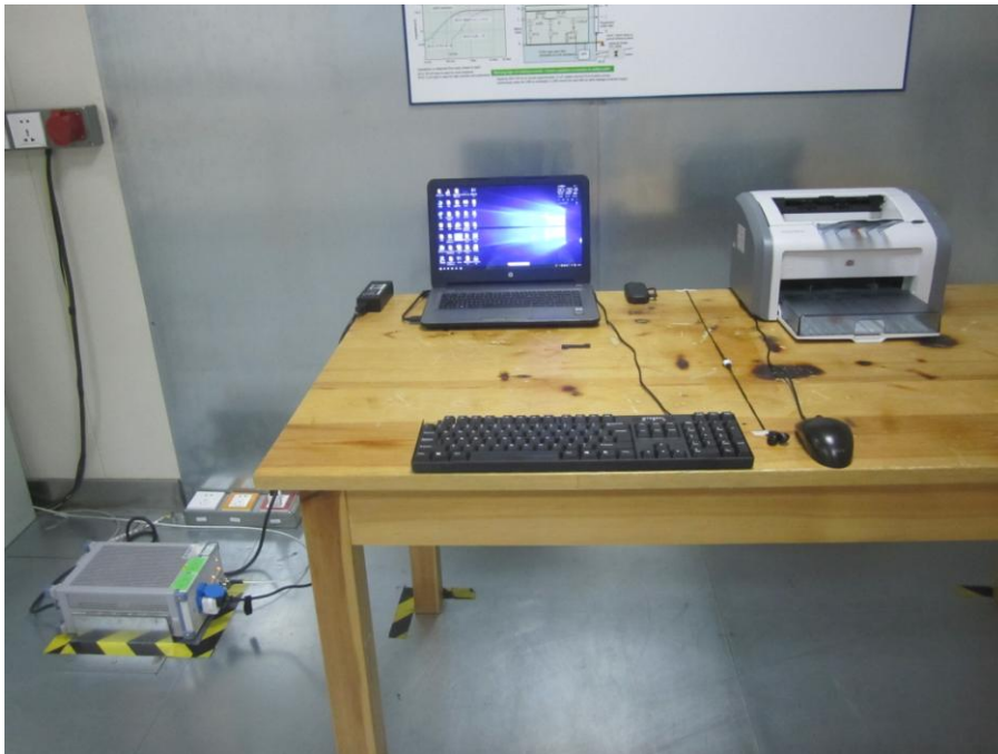
Conducted Measurement Photos