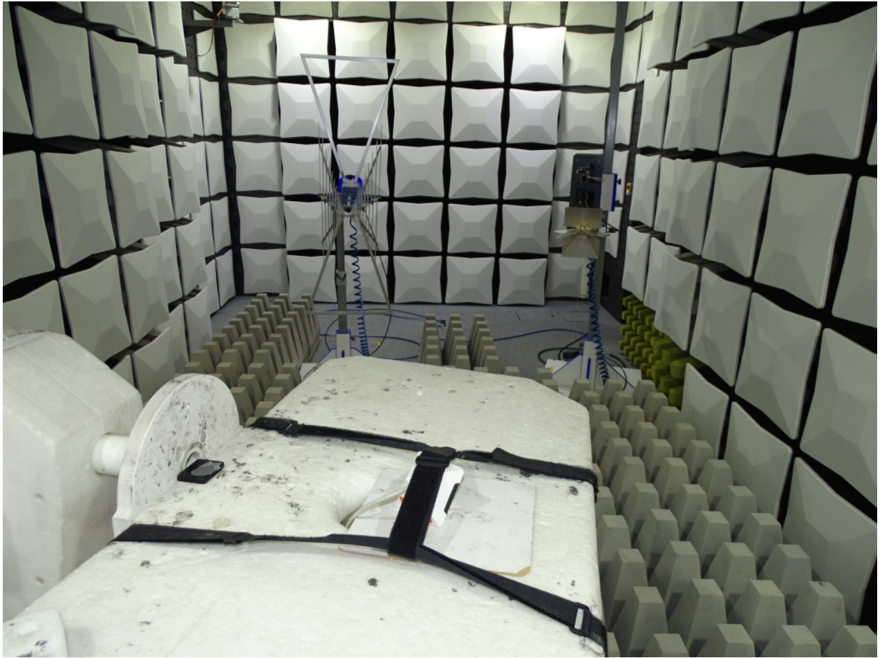
Photo 3: Test setup for radiated measurements (Enclosure, fully-anechoic chamber, 1-26 GHz intentional radiator §15, ANSI C63.10)