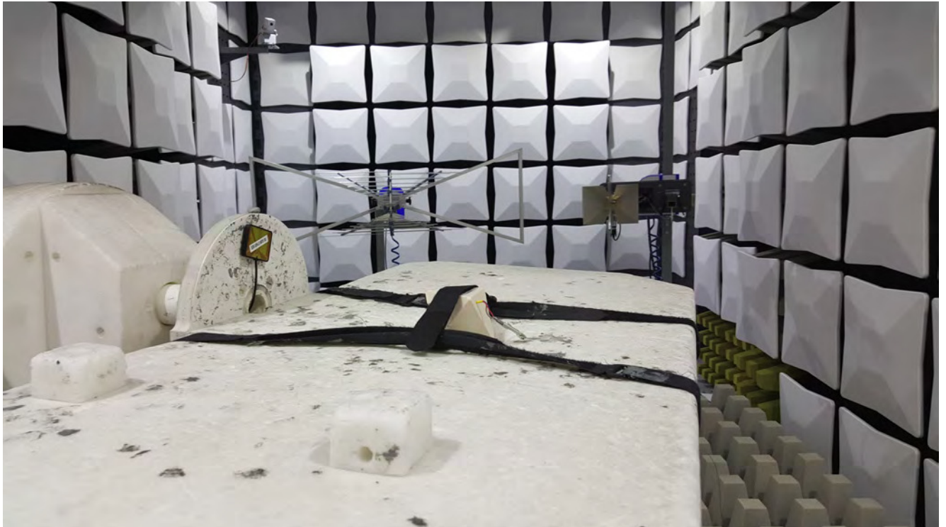
Photo 1: Test setup for radiated measurements (Enclosure, fully-anechoic chamber, 1-18 GHz intentional radiator §15 / 30 MHz – 10/20 GHz §22/24/27)