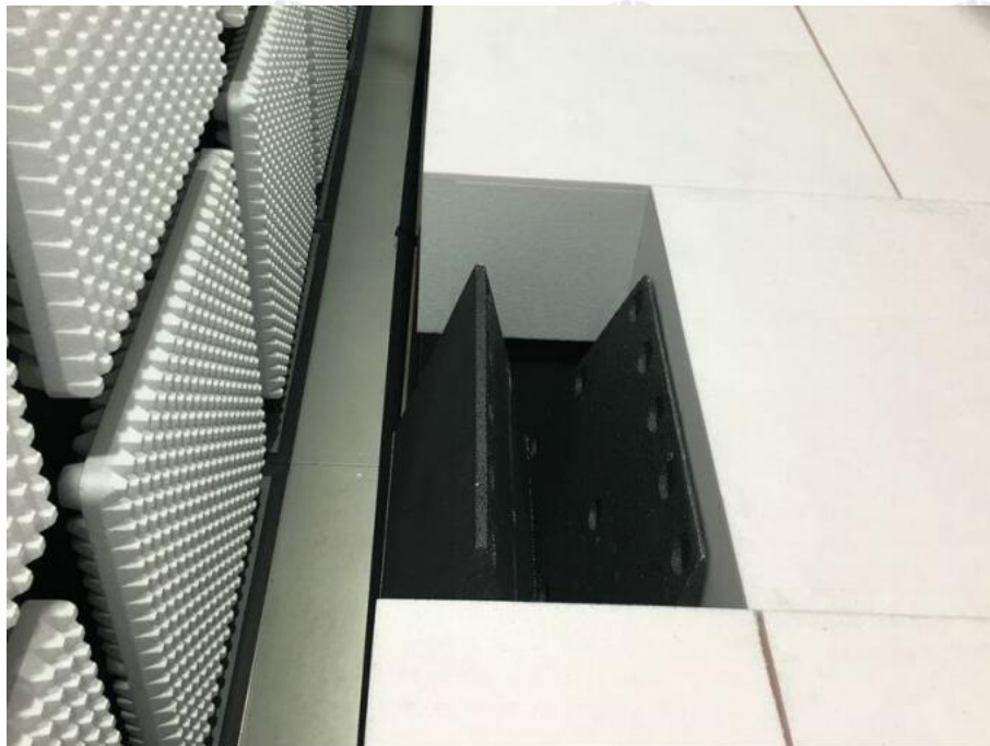
Radiated spurious emission Test Setup-3(Above 1GHz) There are absorbing materials under the ground.