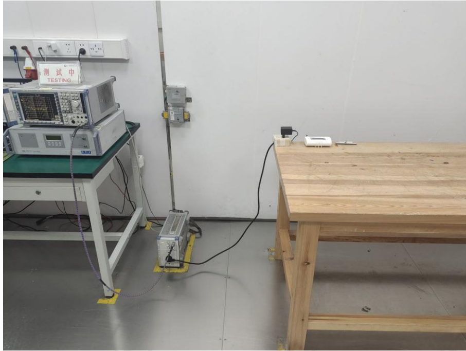
CONDUCTED DISTURBANCE TEST SETUP