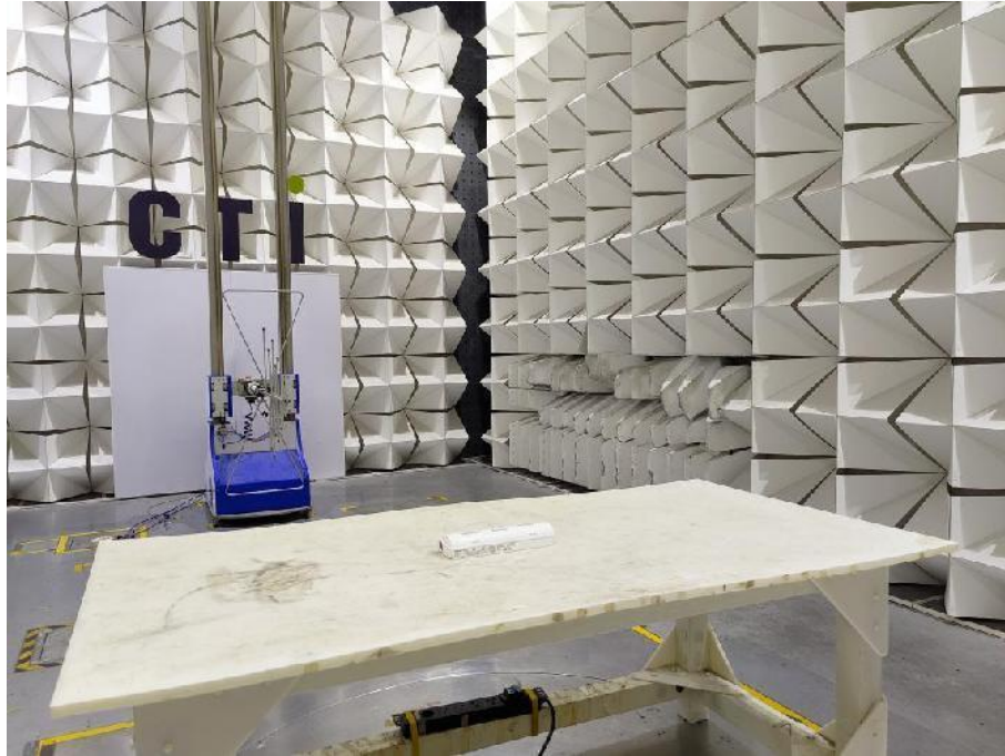
Radiated spurious emission Test Setup-1(Below 1GHz)