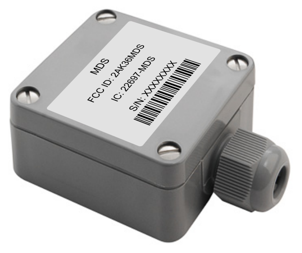
Figure 1: MDS with protective casing and label placement.

MDS on the machine side is placed inside a protective casing (see below). Outside this casing the following sticker will be placed