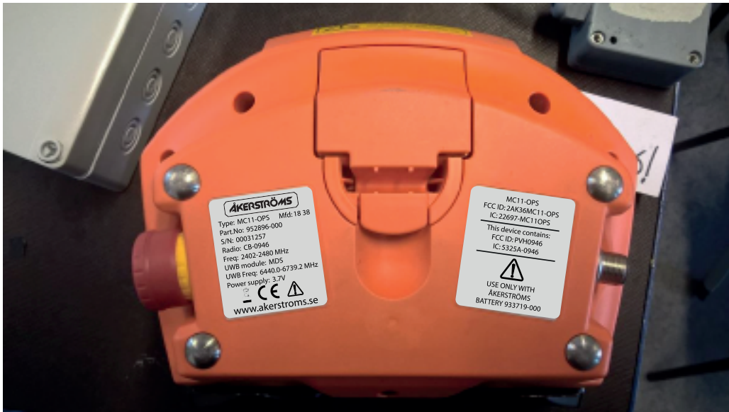
Figure 1: Bottom of remote control.