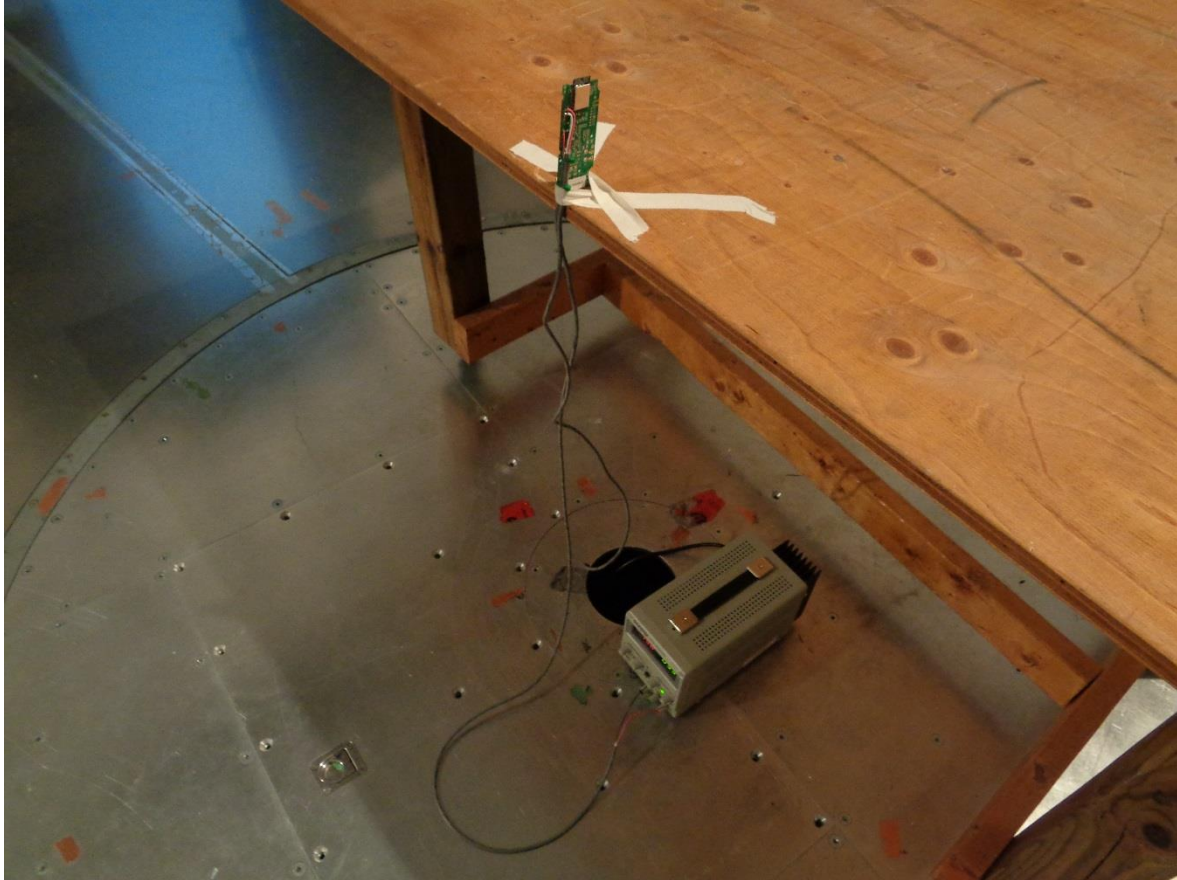
Figure 1 – Radiated Emissions Setup – Photo 1