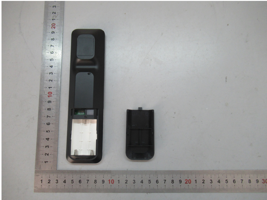
EUT – Cover off View-2