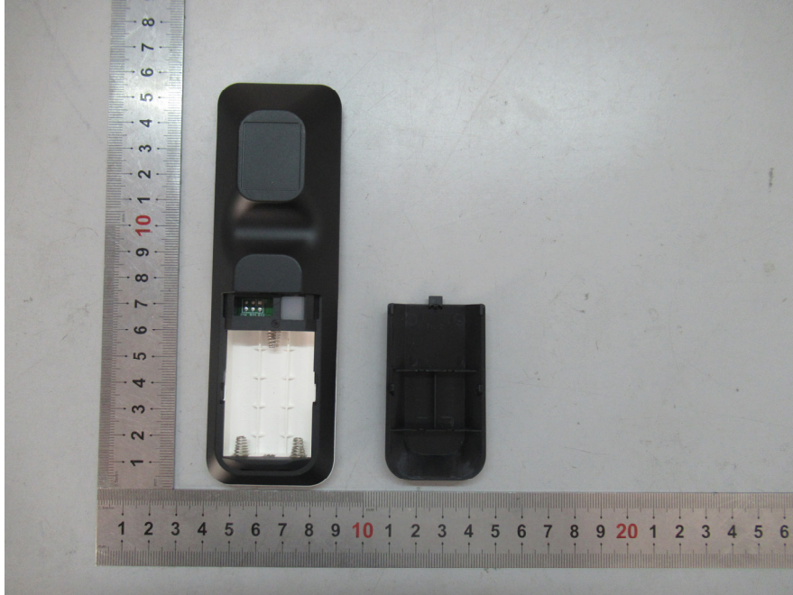
EUT – Cover off View-2