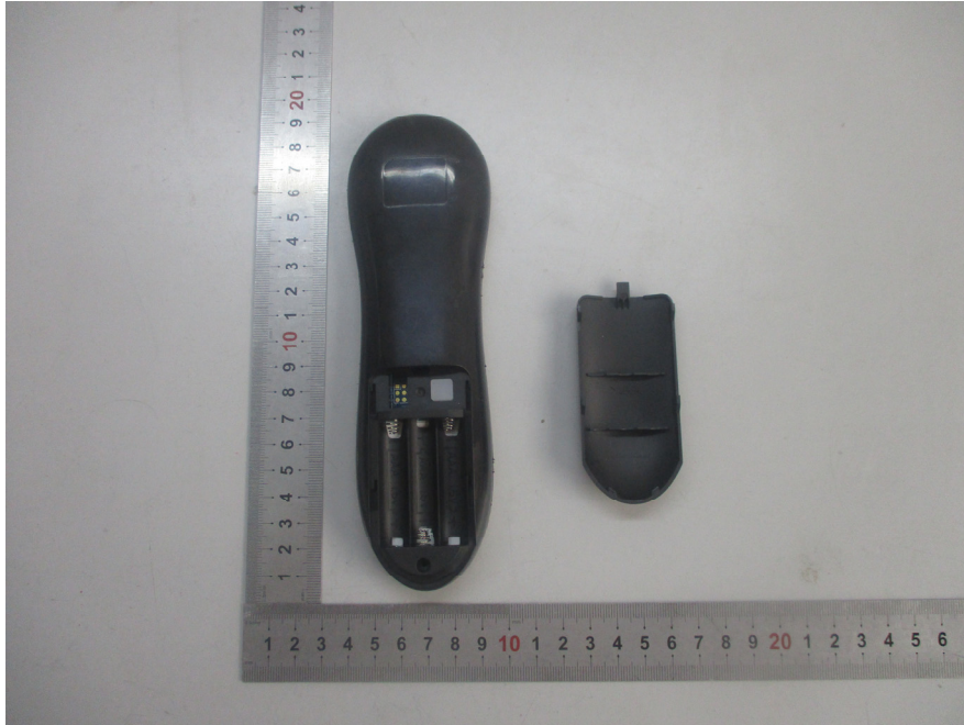
EUT – Cover off View-2