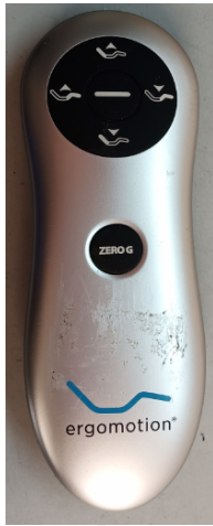
FCC ID: 2AK23RF377AB IC: 22406-RF377AB