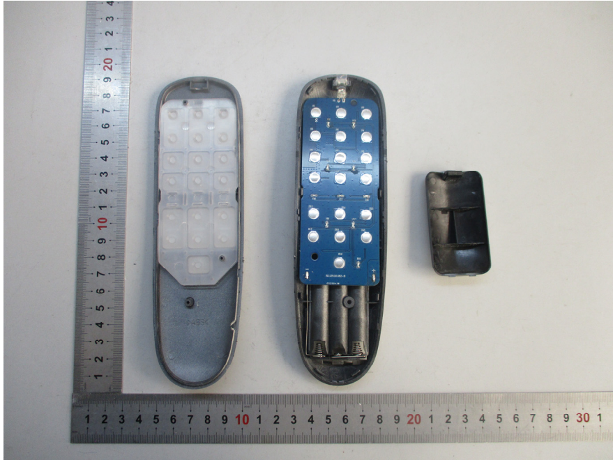
EUT – Cover off View-2