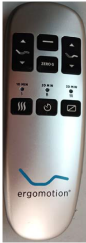
FCC ID: 2AK23RF373AD IC: 22406-RF373AD