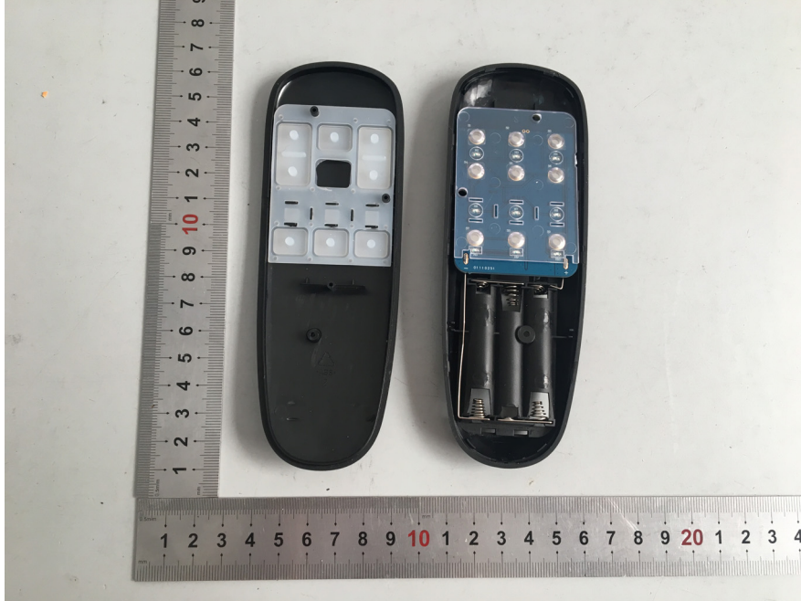
EUT – Cover off View-2