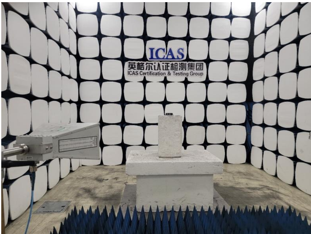
Above 1 GHz