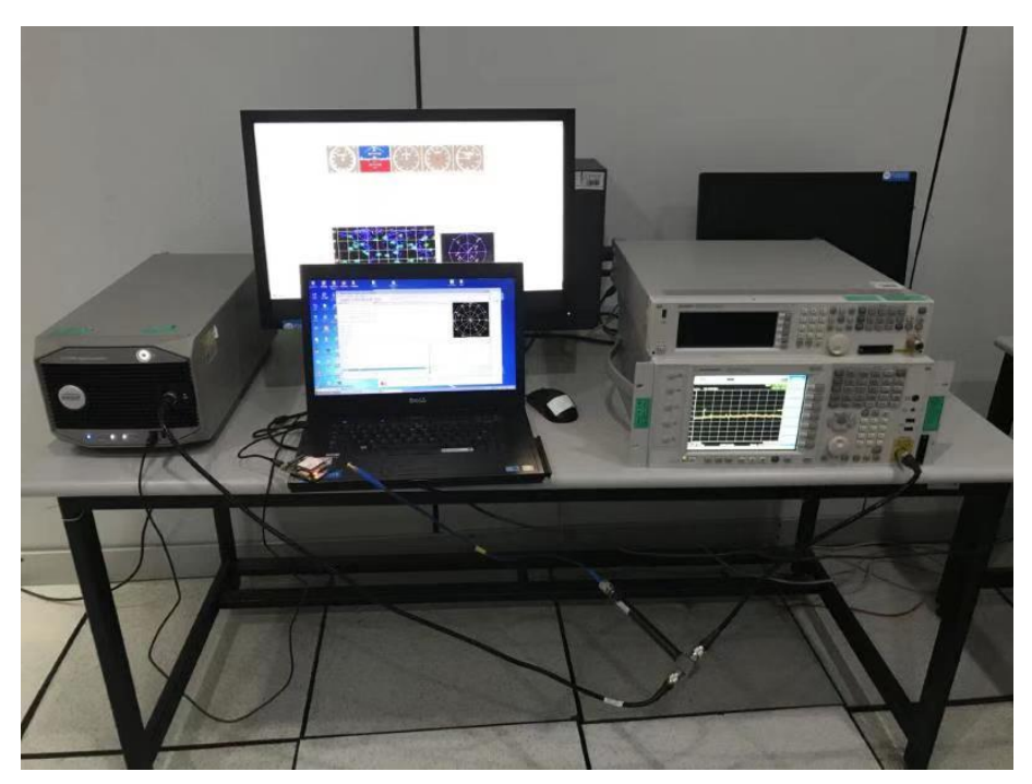
Test Setup Photo for RF test % \left( {{\left[ {{{\rm{T}}_{\rm{T}}} \right]}} \right)