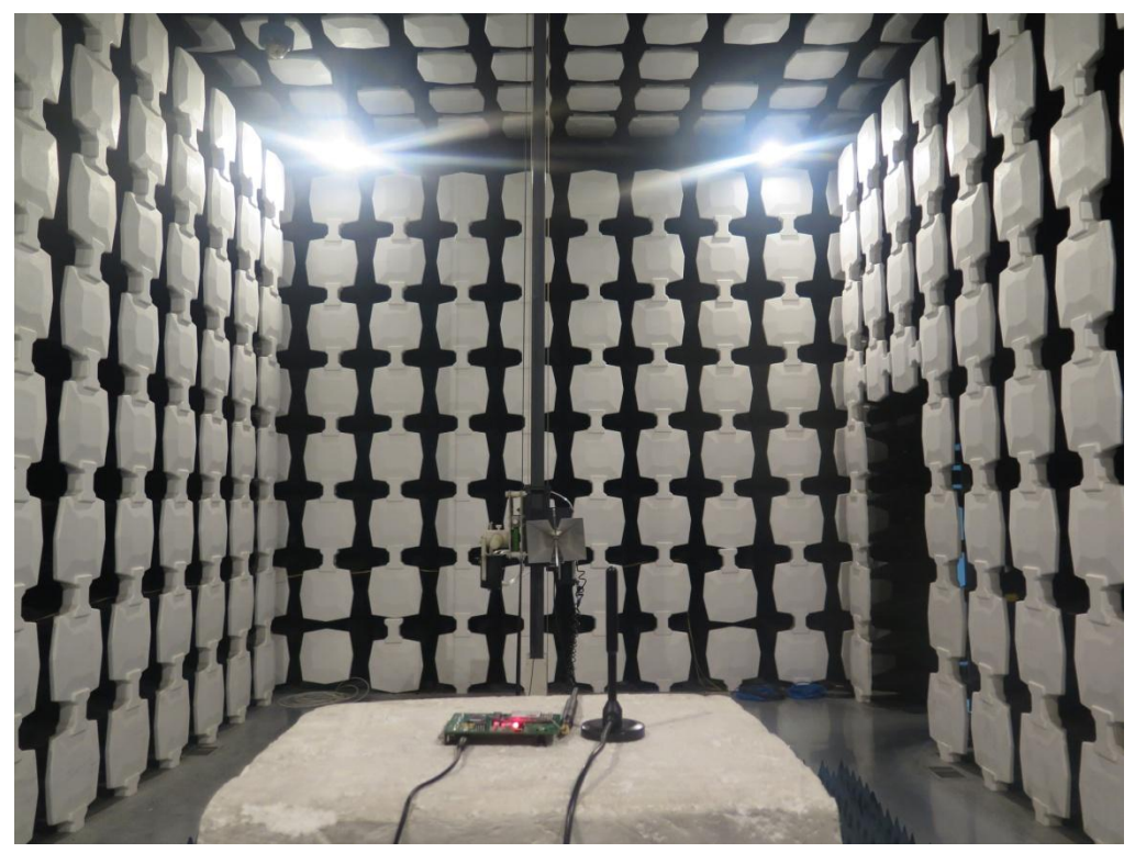
Test Setup Photo for EMC test-RSE 3G -12.\,75\text{G}