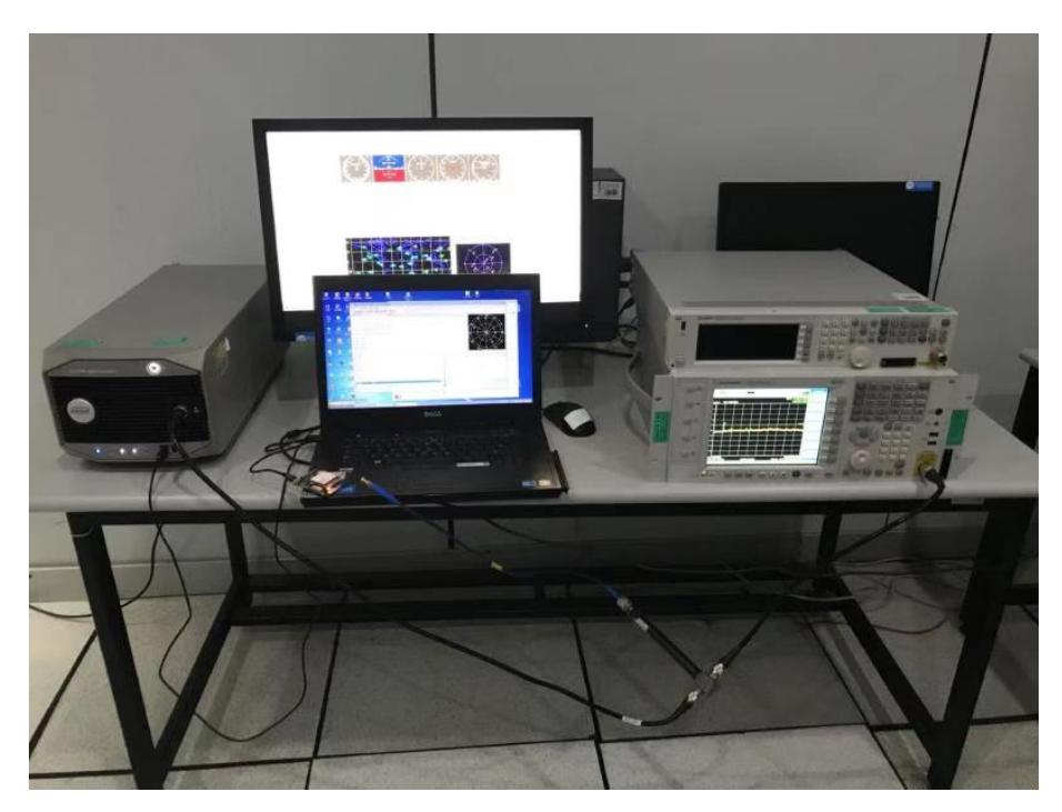
{\tt Test \ Setup \ Photo \ for \ RF \ test}