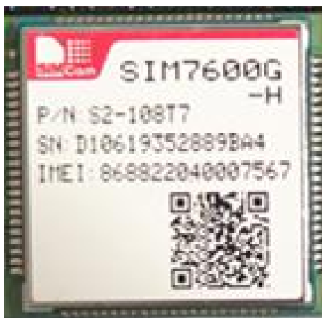
Nameplate of the sample